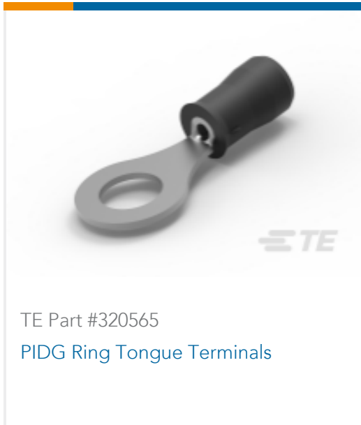
TE Part #320565 PIDG Ring Tongue Terminals