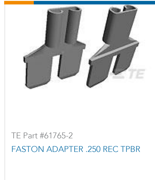
TE Part #61765-2 FASTON ADAPTER .250 REC TPBR