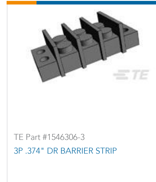
TE Part #1546306-3 3P .374" DR BARRIER STRIP