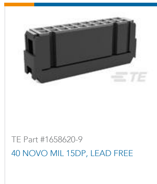
TE Part #1658620-9 40 NOVO MIL 15DP, LEAD FREE