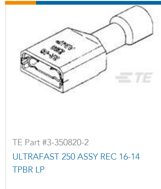
TE Part #3-350820-2 ULTRAFAST 250 ASSY REC 16-14 TPBR LP