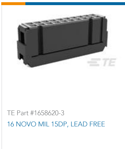
TE Part #1658620-3 16 NOVO MIL 15DP, LEAD FREE