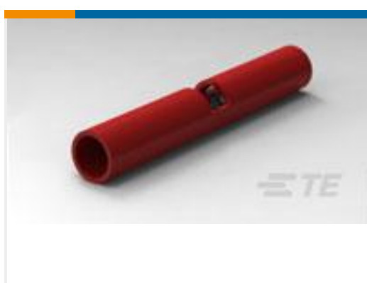
TE Part #2-320559-4 SPLICE BUTT PIDG 22-16; TAPE