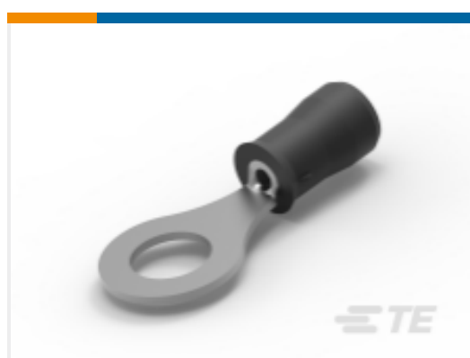
TE Part #52273 PIDG Ring Tongue Terminals