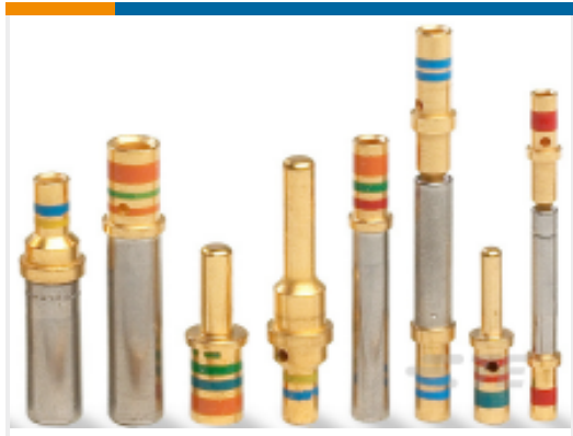
TE Part #4109-207-2000L CONT SOC ASSY