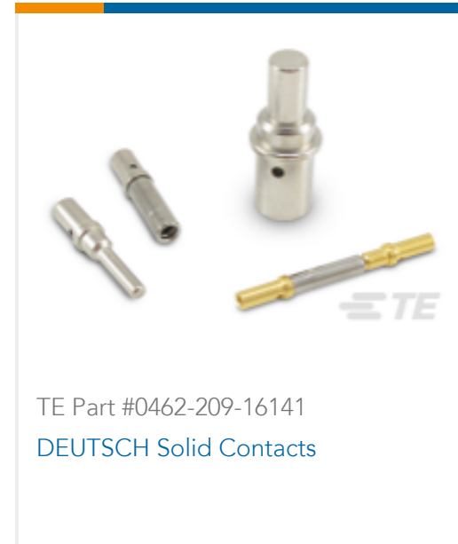
TE Part #0462-209-16141 DEUTSCH Solid Contacts