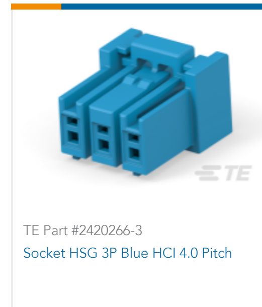
TE Part #2420266-3 Socket HSG 3P Blue HCI 4.0 Pitch