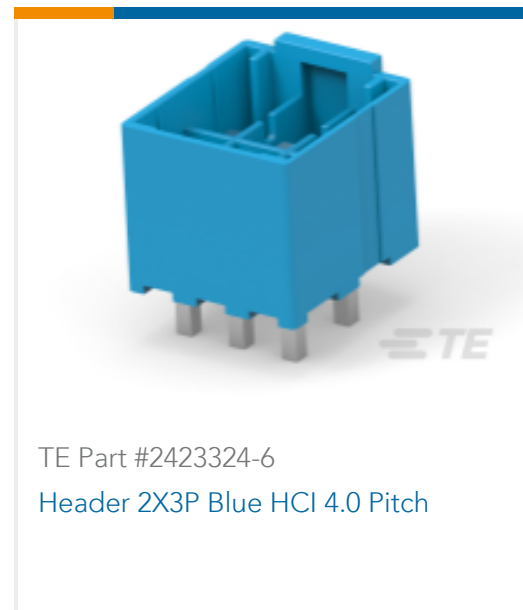
TE Part #2423324-6 Header 2X3P Blue HCI 4.0 Pitch