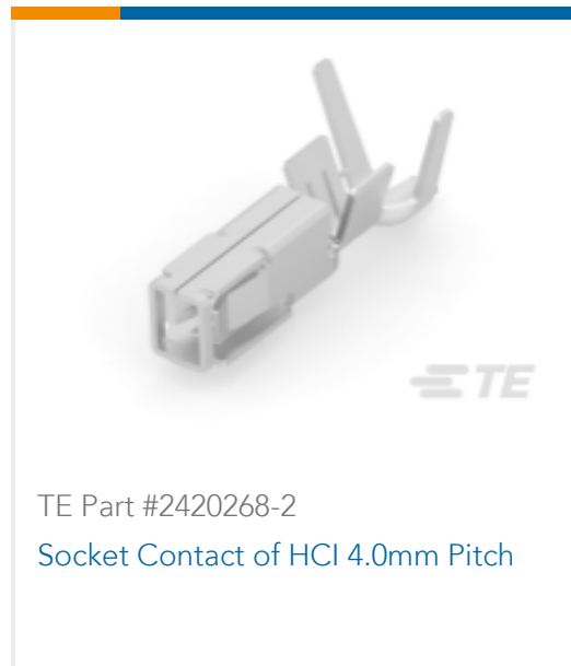
TE Part #2420268-2 Socket Contact of HCI 4.0mm Pitch