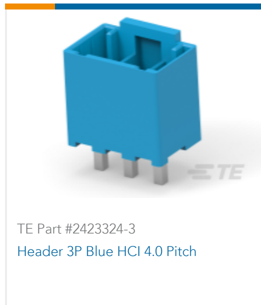
TE Part #2423324-3 Header 3P Blue HCI 4.0 Pitch