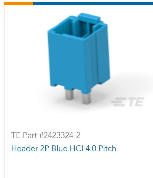
TE Part #2423324-2 Header 2P Blue HCI 4.0 Pitch