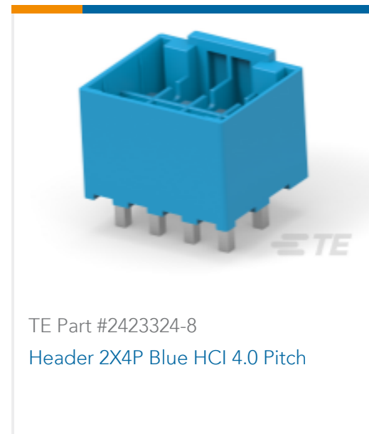
TE Part #2423324-8 Header 2X4P Blue HCI 4.0 Pitch