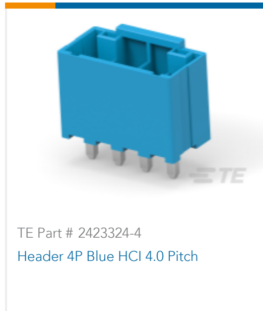
TE Part # 2423324-4 Header 4P Blue HCI 4.0 Pitch