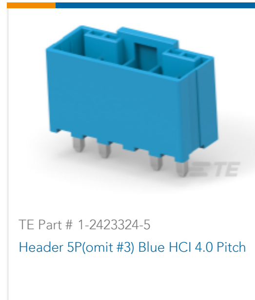
TE Part # 1-2423324-5 Header 5P(omit #3) Blue HCI 4.0 Pitch