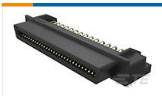
TE Part #5175474-6 CHAMP 050 B/B REC H W/LEG 50P