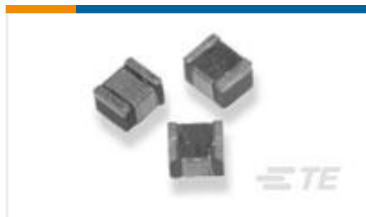
TE Part #1879023-6 3650 1008 22nH 5% 2K RL