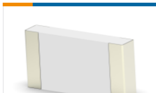
TE Part #5-2176245-5 CRGS1206 5% 33K