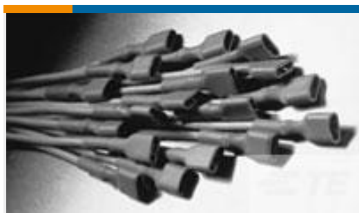
TE Part #2859674001 LSTT-9.5-2-SP