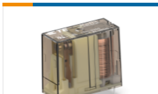
TE Part #8-1415546-7 RP314012