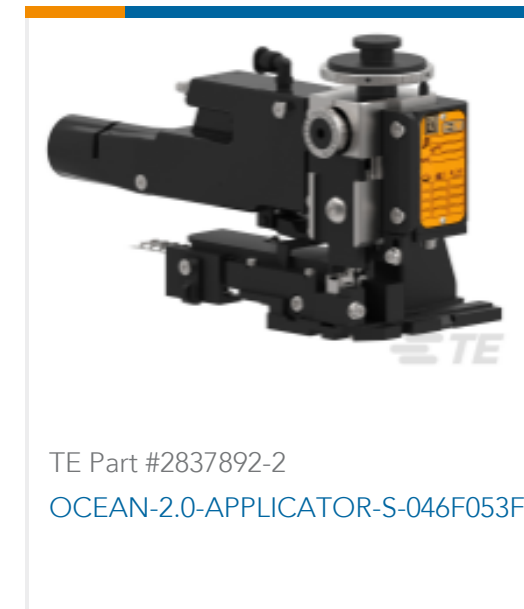
TE Part #2837892-2 OCEAN-2.0-APPLICATOR-S-046F053F