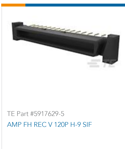
TE Part #5917629-5 AMP FH REC V 120P H-9 SIF