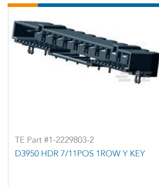
TE Part #1-2229803-2 D3950 HDR 7/11POS 1ROW Y KEY