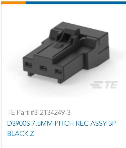
TE Part #3-2134249-3 D3900S 7.5MM PITCH REC ASSY 3P BLACK Z