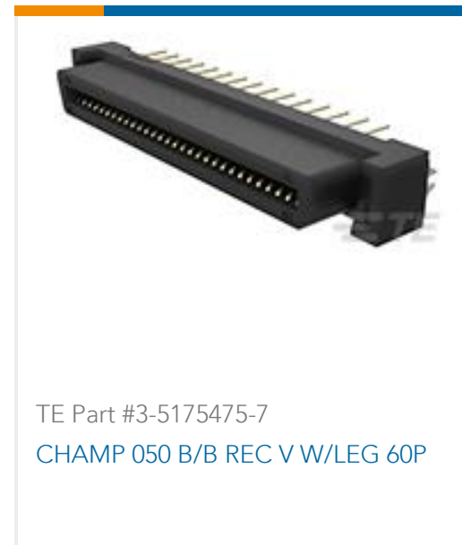
TE Part #3-5175475-7 CHAMP 050 B/B REC V W/LEG 60P