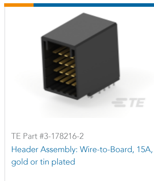
TE Part #3-178216-2 Header Assembly: Wire-to-Board, 15A, gold or tin plated