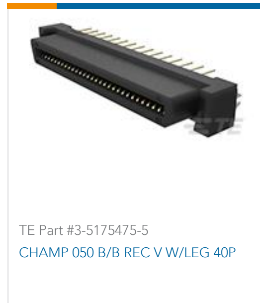
TE Part #3-5175475-5 CHAMP 050 B/B REC V W/LEG 40P