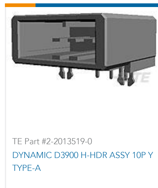
TE Part #2-2013519-0 DYNAMIC D3900 H-HDR ASSY 10P Y TYPE-A