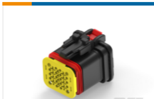
TE Part #2350890-1 20POS,HYBRID,SOC HSG ASSY,SLD, COD A