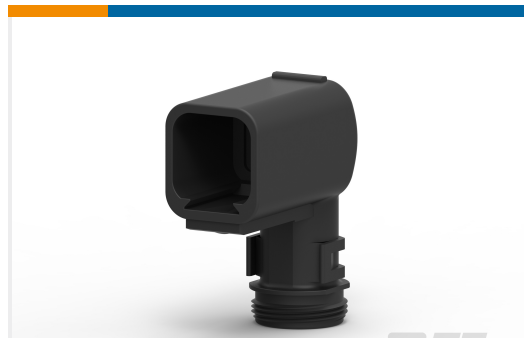
TE Part #1011-242-0605 BKSHL, 6P, BLK, REC, RA, NW8.5/10/13