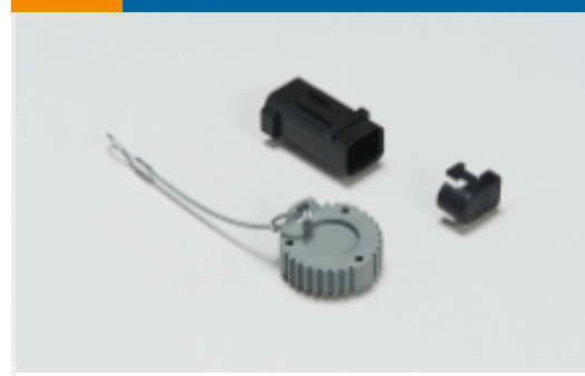
Automotive Connector Caps & Covers (5)