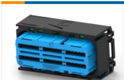
TE Part #2098866-1 PLUG ASSY, 96P GPECIII KEY H L