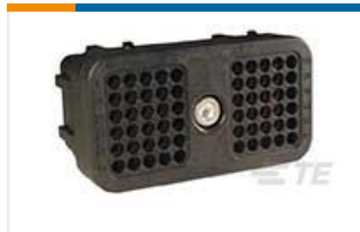
TE Part #DRC26-60S06 PLG, 60P, BLK, N, 06