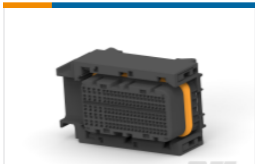
TE Part #1-2208720-1 105POS,MCON 1.2 CB,REC HSG, ASSY,SLD