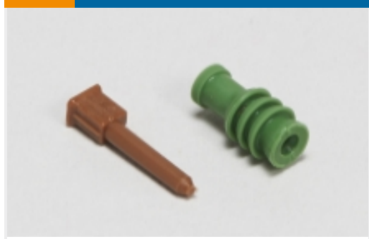
Automotive Seals & Cavity Plugs(2)