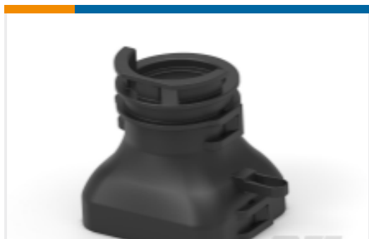
TE Part #2357302-1 BACKSHELL,CONN KIT