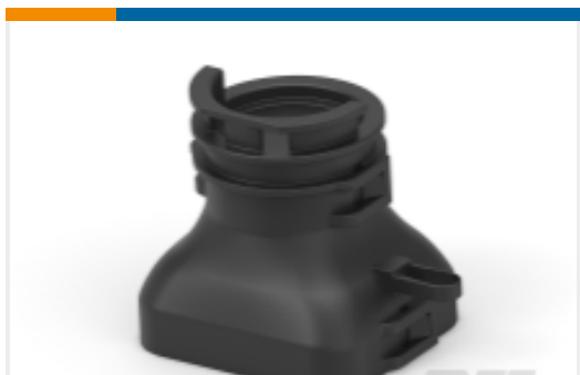
TE Part #2357302-2 BACKSHELL,CONN KIT