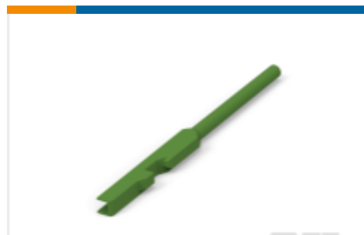
TE Part #2286476-2 BLIND PLUG,MCON 1.2 CB