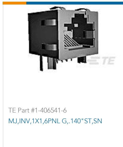
TE Part #1-406541-6 MJ,INV,1X1,6PNL G.,.140"ST,SN