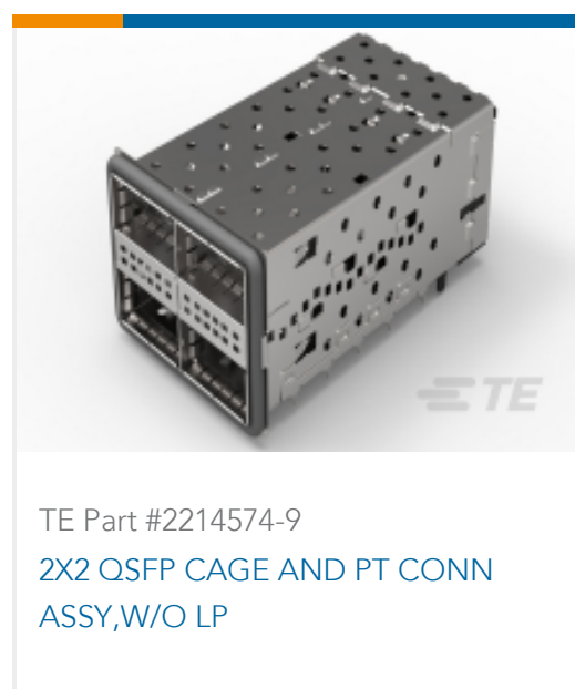
TE Part #2214574-9 2X2 QSFP CAGE AND PT CONN ASSY,W/O LP