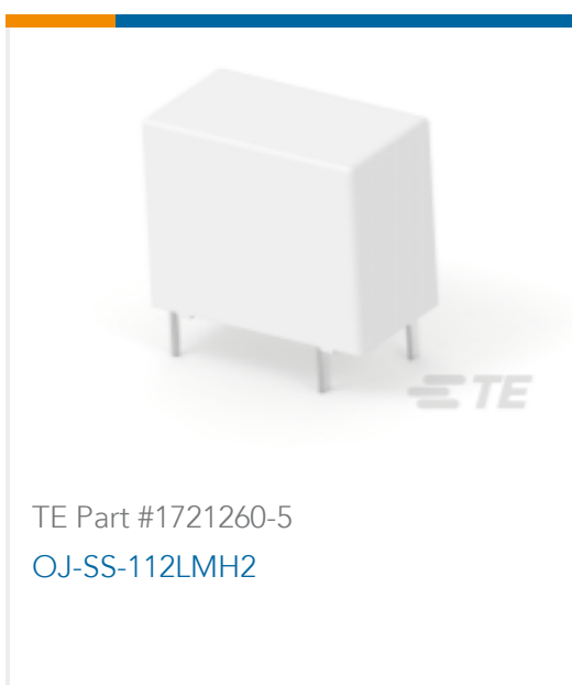
TE Part #1721260-5 OJ-SS-112LMH2