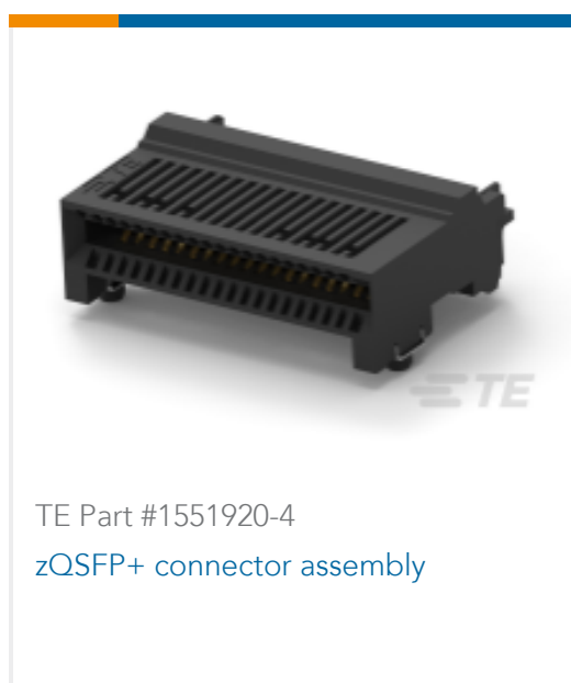
TE Part #1551920-4 zQSFP+ connector assembly