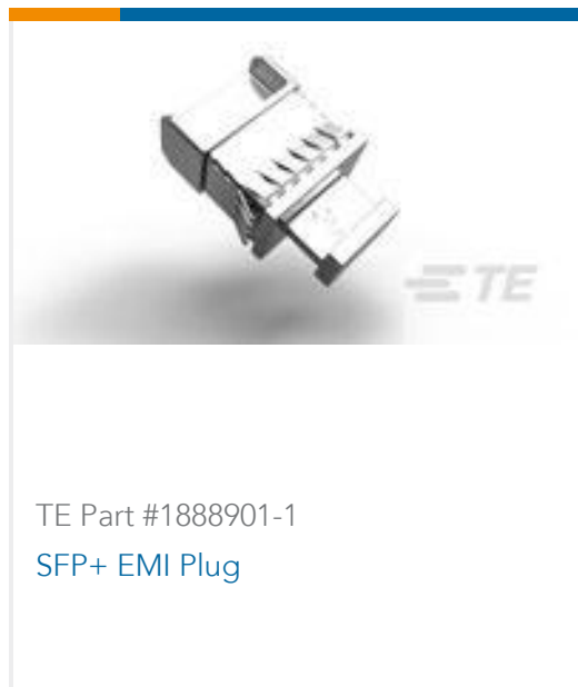
TE Part #1888901-1 SFP+ EMI Plug