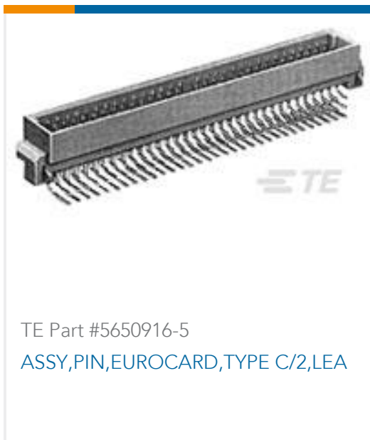
TE Part #5650916-5 ASSY,PIN,EUROCARD,TYPE C/2,LEA