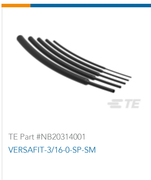
TE Part #NB20314001 VERSAFIT-3/16-0-SP-SM