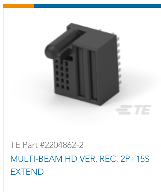
TE Part #2204862-2 MULTI-BEAM HD VER. REC. 2P+15S EXTEND