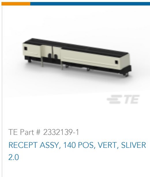
TE Part # 2332139-1 RECEPT ASSY, 140 POS, VERT, SLIVER 2.0