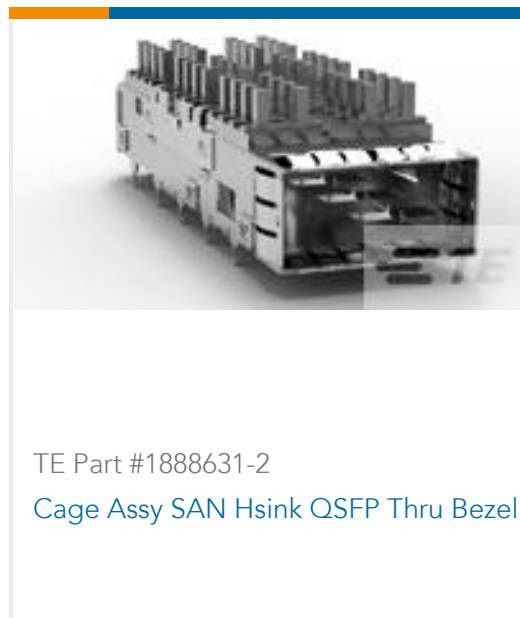
TE Part #1888631-2 Cage Assy SAN Hsink QSFP Thru Bezel