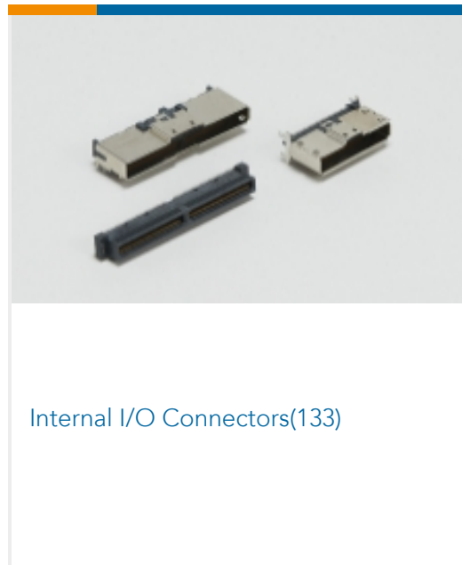
Internal I/O Connectors(133)