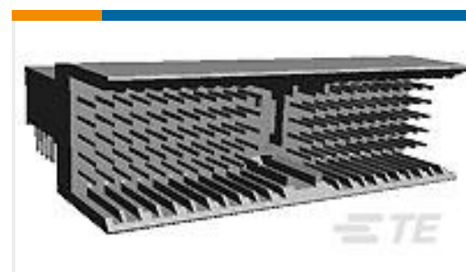
TE Part #6345056-1 Z-PACK/B RAMH.110P.