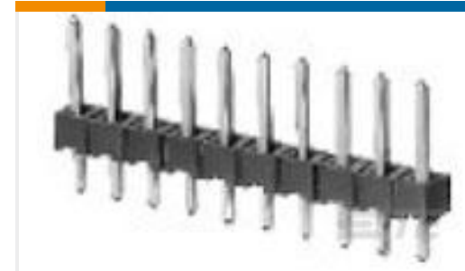
TE Part #6-146285-6 16 MODII HDR SRST B/A .100CL