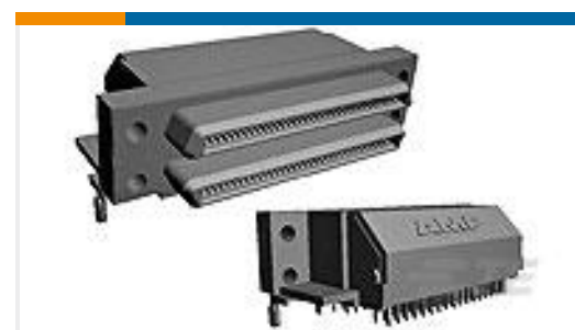
TE Part #6364306-1 .8MM CHAMP STACK ASSY W/COVER