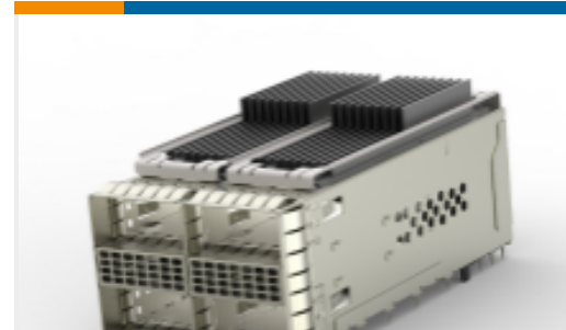
TE Part #1-2300832-7 Heat Sink Clip