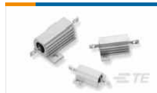
TE Part #1879071-4 THS50 R10 5%