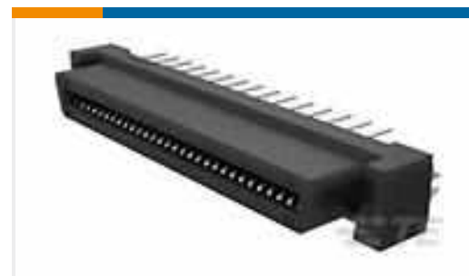
TE Part #1734101-4 Champ050 series,40pos,Au over PdNi