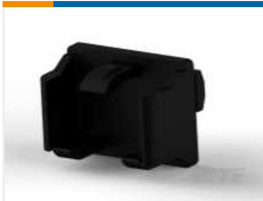
TE Part # 1761394-1 DUST COVER, SFP, GANGED & STACKED