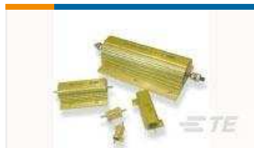
TE Part #1625984-5 HSA50 10R 5%