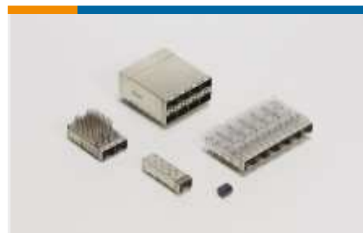
SFP, SFP+ & zSFP+(53)