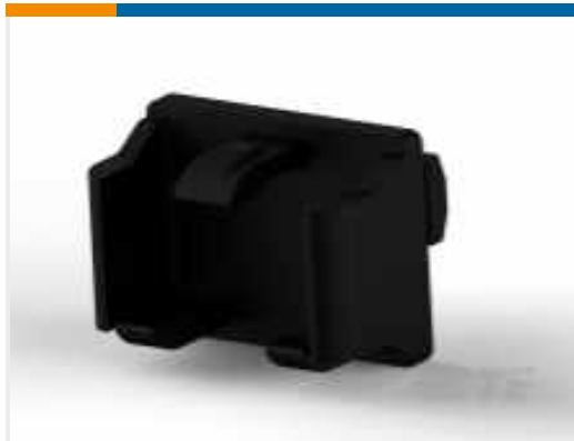
TE Part # 1761394-1 DUST COVER, SFP, GANGED & STACKED