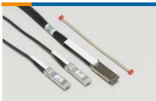
Pluggable I/O Cable Assemblies(17)