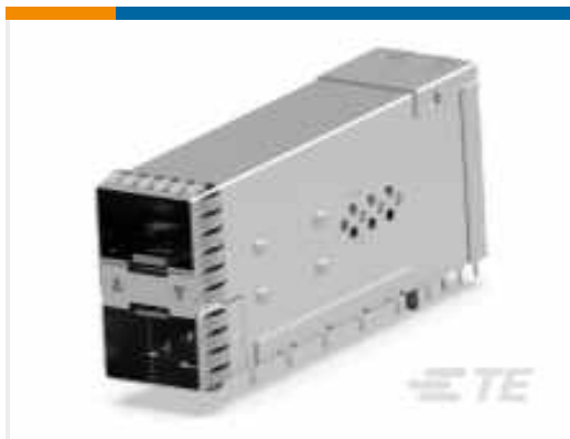
TE Part #2-2349202-0 SFP56 STACKED 2X1 RECEPTACLE ASSEMBLY