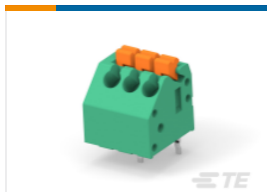
TE Part #1-2834011-3 3POS 3.5MM TOP ENTRY SCREWLESS CONN.