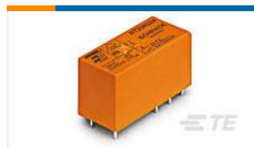
TE Part #1415898 RTS3T012