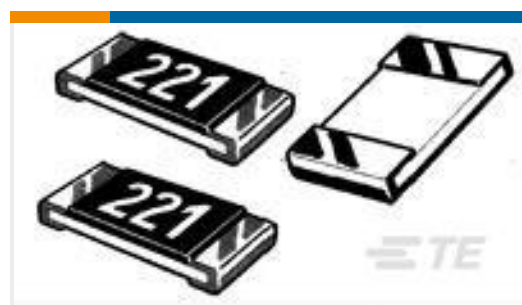
TE Part #2176070-8 3521 20R 1% 2W