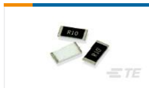
TE Part #6-1622824-1 RL73N 1J R10 5% 5K RL