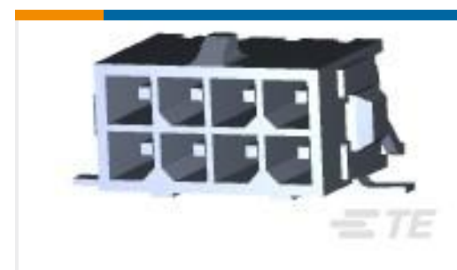
TE Part #3-794627-8 08P MICRO MNL ASSY, RA, SMT, L