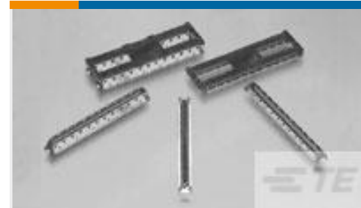
TE Part #3-1827231-6 .5FHR04H,440,B,GIG,08/Sn,HT,NS