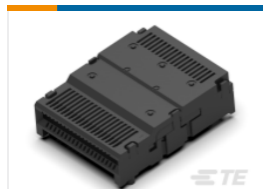
TE Part #2318579-2 RCPT CONN R/A SMT 76 POSN OSFP-DD WSHRS