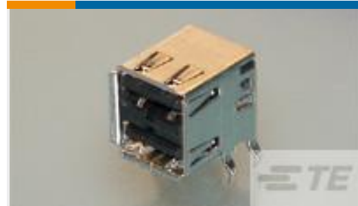
TE Part #5787617-1 RECP ASSY, R/A, STACKED, THRU-HOLE, USB,