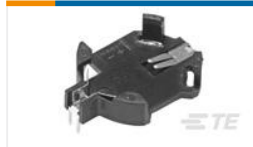
TE Part #120591-1 TOP LOAD BATTERY