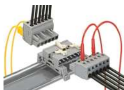
Angled female connector – straight female connector