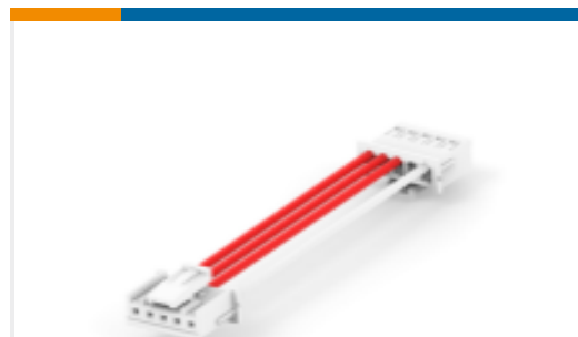
TE Part #2318044-1 CABLE ASSEMBLY, EB, SK5 POS EP 2P5