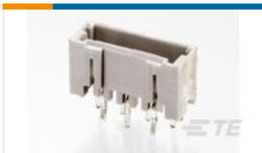
TE Part #292207-3 MINI CT SGL DIP V 3P NAT