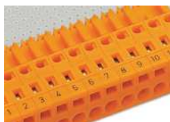
Labeling via direct marking or self-adhesive strips.