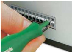
Feedthrough PCB terminal strips – front-entry conductor termination