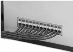
Feedthrough PCB terminal strips can be used as front-panel feedthrough for external conductor termination.