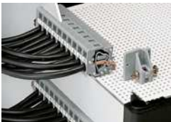
With flanges for PCB or front-panel mounting – either flush with enclosure or protruding