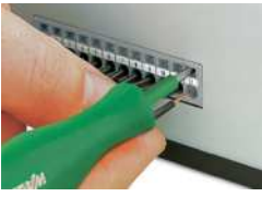
Feedthrough PCB terminal strips – front-entry conductor termination