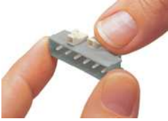
Coding a male header – fitting coding key (s).