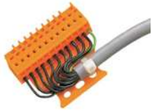
Male connector with strain relief plate