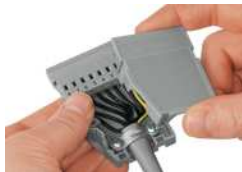
Strain relief housing shown with a male connector equipped with CAGE CLAMP®