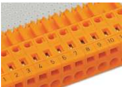
Labeling via direct marking or self-adhesive strips.