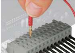
Testing – female connector with CAGE CLAMP® Integrated test ports for testing perpendicular to conductor entry via 2 or 2.3 mm Ø test plug