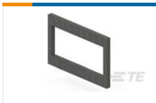
TE Part #2132186-1 EMI Gasket, QSFP/XFP 1x1