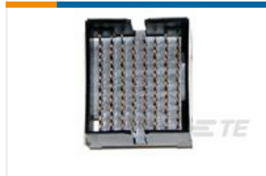
TE Part #1934346-1 Tin Man Header Assy 3x16 Double