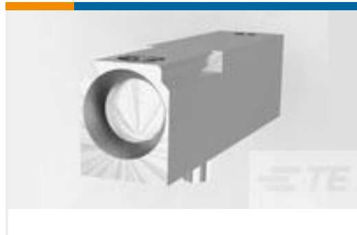
TE Part #5223957-3 UPM GUIDE MODULE