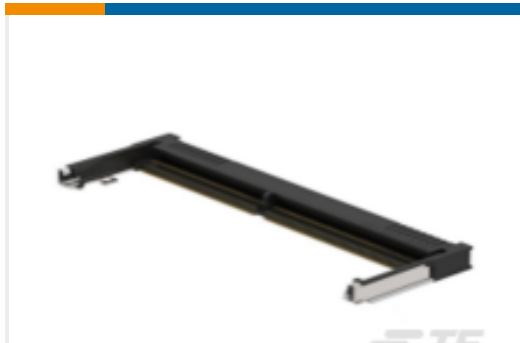
TE Part #2309409-1 DDR4 SO DIMM Sockets