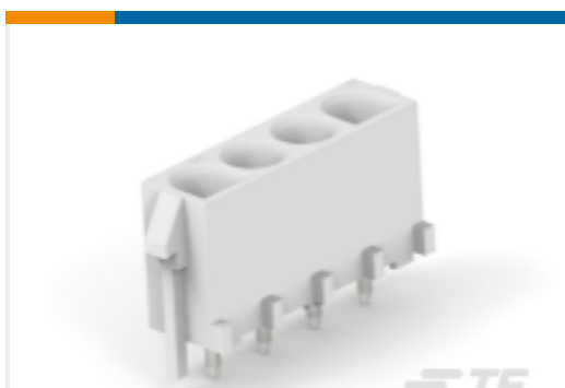
TE Part #194234-2 PIN HDR ASSY,MNL,4 CIR,LUBR'D