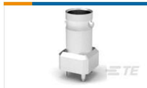
TE Part #2016080-2 JACK,PCB,COMMERCIAL BNC