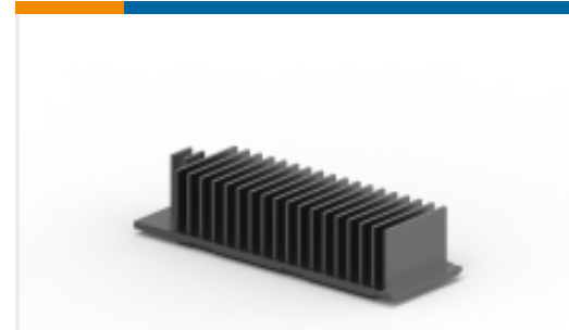
TE Part #2289501-3 HEAT SINK FOR CFP4