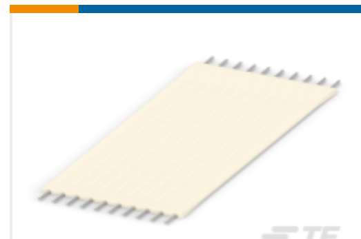
TE Part #1474640-7 FSP-23.5Z-3