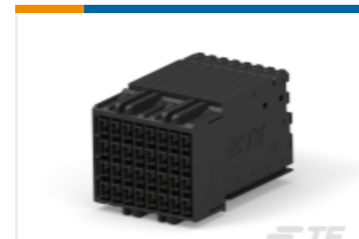
TE Part #2298079-1 SW RA RCP ASM, 4P, 8C, 85O, PIC, INV HSG