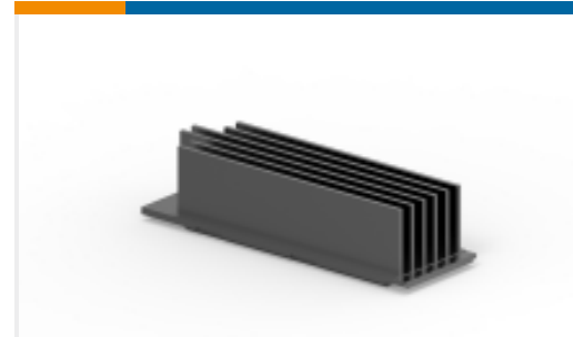
TE Part #2288231-3 CFP4 HEATSINK, FRONT TO BACK AIRFLOW