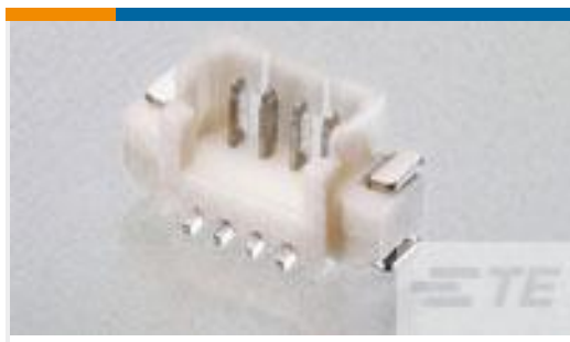
TE Part #1734260-9 1.25 WTB HDR SMT, 9 POS