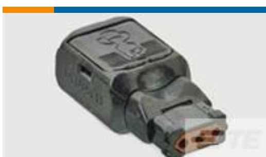
TE Part #D369-R33-NS1 369 3 WAY REC, CRIMP, SKT