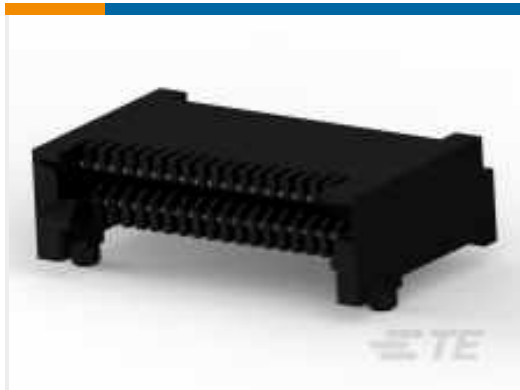
TE Part # 2110819-1 QSFP+ Enh EVERCLEAR PT Conn