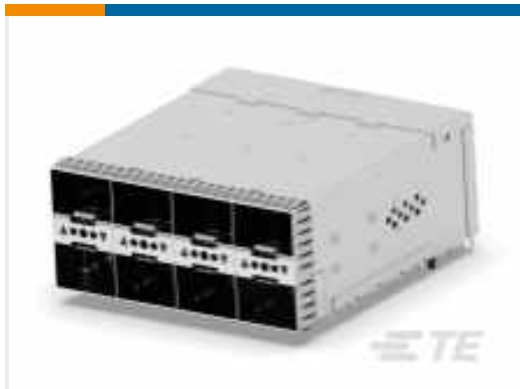
TE Part #2198325-7 zSFP+ Stacked Cage Assembly: EMI Spring