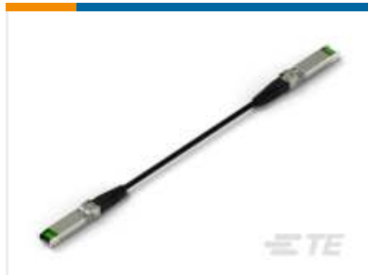
TE Part #2821224-1 SFP28 DIRECT ATTACH CA, 1M, 26AWG