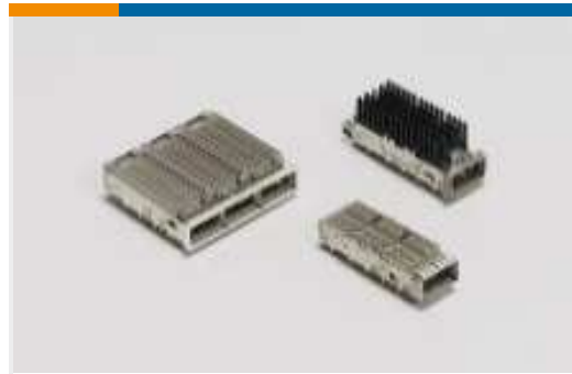
QSFP, QSFP+ & zQSFP+(432)