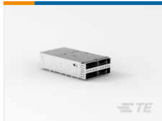
TE Part #2289129-1 ZQSFP+ CAGE& CONN 2X2, EMI SPRING, 4 LP