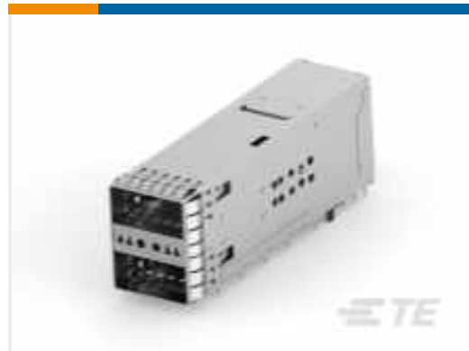
TE Part #2227669-7 ZQSFP+ STACKED REC ASSEMBLY 2X1,4LP 4UP