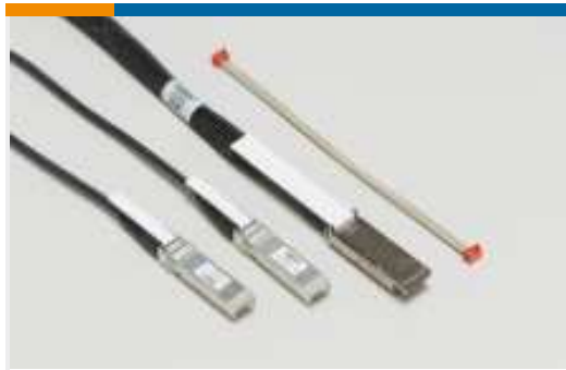
Pluggable I/O Cable Assemblies(81)