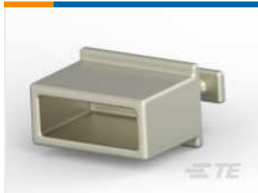
TE Part # 1888810-2 EMI/Dust Cover, XFP And QSFP