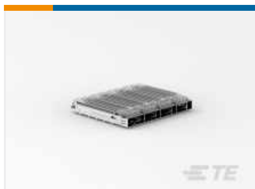
TE Part #4-2170747-1 CAGE ASSY, 1X4, QSFP28, SPRING, HS, LP