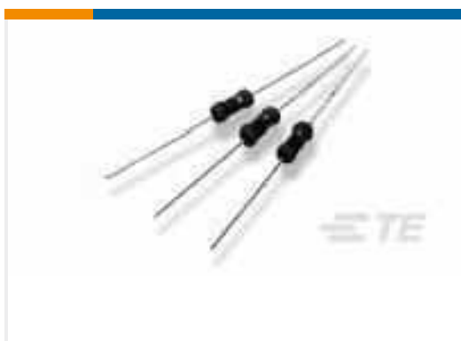
TE Part #3-1624246-7 RSS3 4K7 5% AMMO PK