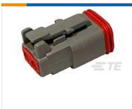
TE Part # DT06-2S PLG, 2P, GRY, N