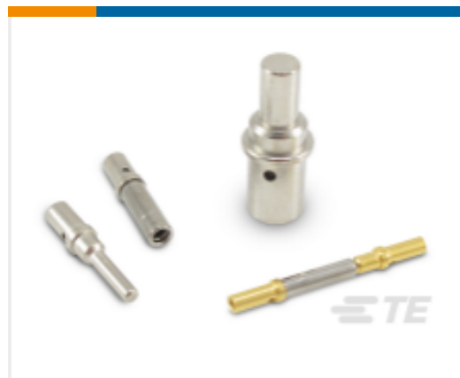
TE Part # 0460-202-16141 DEUTSCH Solid Contacts