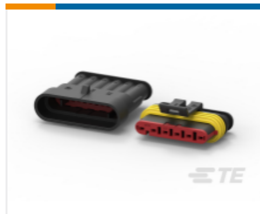
TE Part # 282104-1 AMP SUPERSEAL 1.5MM, CONNECTOR HOUSING