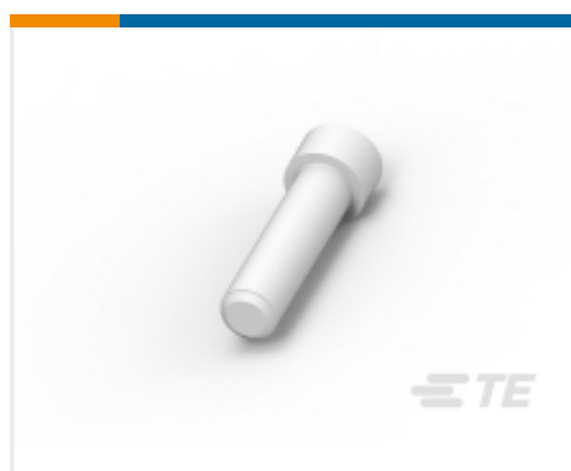
TE Part # 114017-ZZ SEALING PLUG, SIZE 12/16, WHT