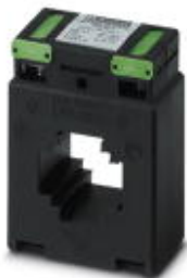
Window-type current transformer, 200 A AC primary current; 5 A AC secondary current; accuracy class 1; 5 VA rated power

Please be informed that the data shown in this PDF Document is generated from our Online Catalog. Please find the complete data in the user's documentation. Our General Terms of Use for Downloads are valid ( http://phoenixcontact.com/download )