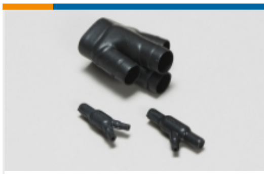
Cable Transitions & Breakouts(1)