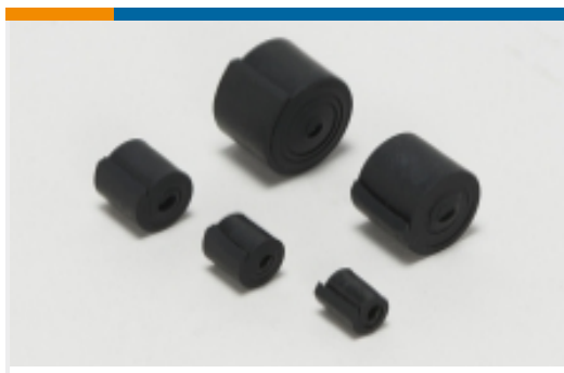
Bushings & Bobbins(5)