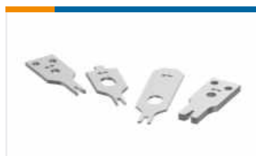
CRIMPER REPRESENTATION ONLY