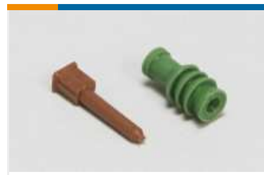
Automotive Seals & Cavity Plugs(5)