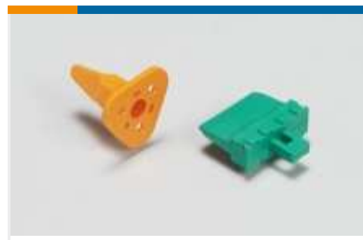
Automotive Connector Locks & Position Assurance(11)