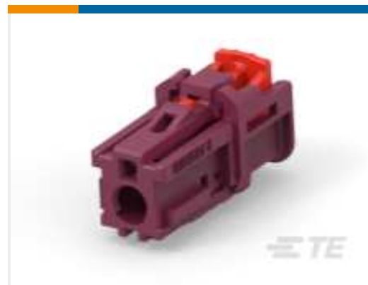
TE Part #2-2310137-4 1 POS MATE-AX, SOC HSG W CPA, COD D