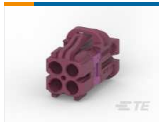
TE Part #2298721-4 4POS,MATE-AX,SOC HSG ASSY, 180DEG,COD D