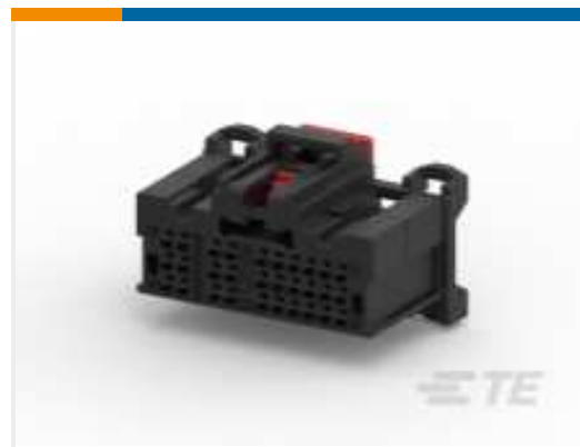
TE Part #2309644-1 30P NANOMQS/US050 LL CONN, W /CPA, KEY A