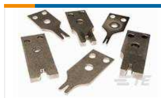
TE Part #7-456404-2 CRIMPER, WIRE .070 F PREMIUM