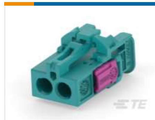
TE Part #2306868-9 2POS,MATE-AX,SOC HSG ASSY,COD Z