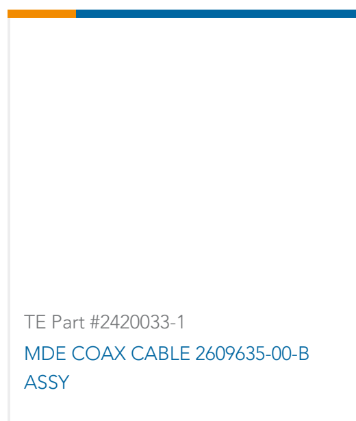
TE Part #2420033-1 MDE COAX CABLE 2609635-00-B ASSY