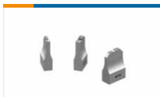
ANVIL REPRESENTATION ONLY