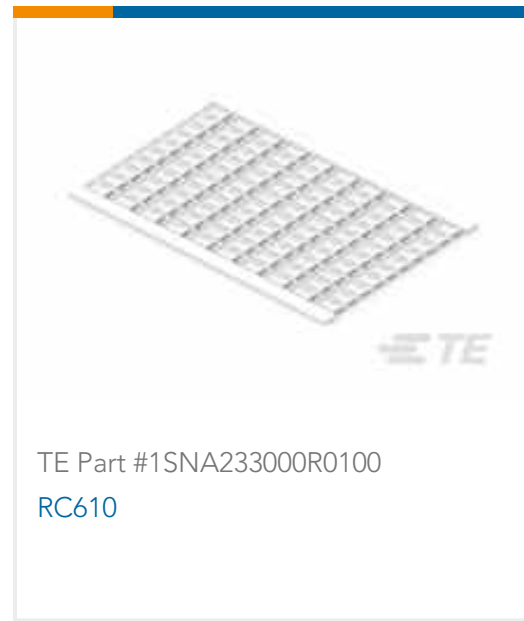
TE Part #1SNA233000R0100 RC610