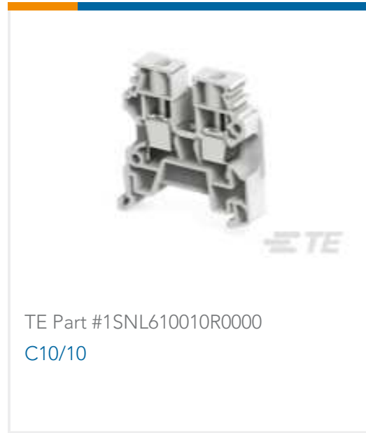
TE Part #1SNL610010R0000 C10/10