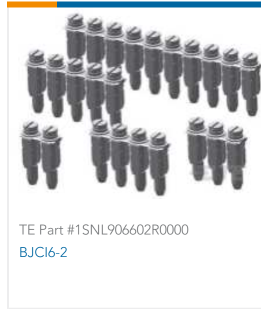
TE Part #1SNL906602R0000 BJC16-2