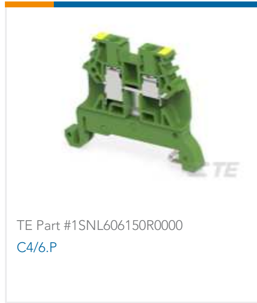
TE Part #1SNL606150R0000 C4/6.P