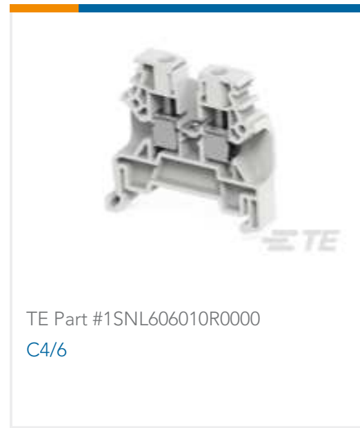
TE Part #1SNL606010R0000 C4/6