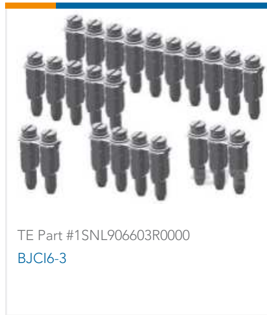
TE Part #1SNL906603R0000 BJC16-3