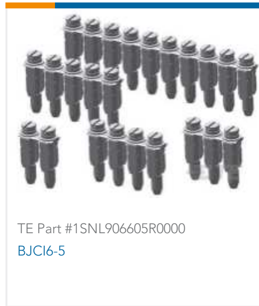
TE Part #1SNL906605R0000 BJC16-5