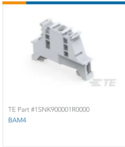
TE Part #1SNK900001R0000 BAM4