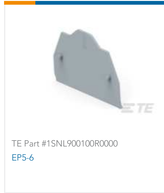
TE Part #1SNL900100R0000 EP5-6