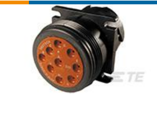
TE Part #HD10-9-1939PE SQ FG REC ASM