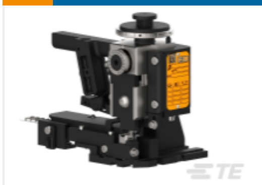
TE Part # 2151338-1 OCEAN-2.0-APPLICATOR-S-140F140O210O