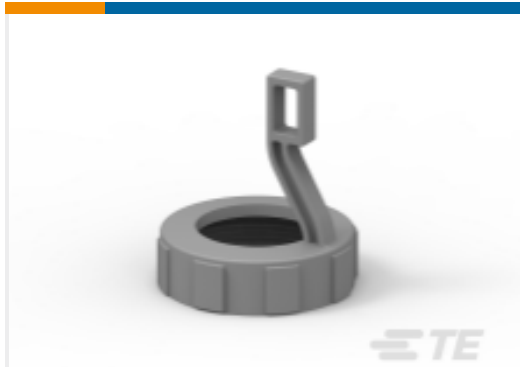
TE Part #HD18-009 BACK SHELL