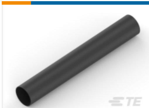
TE Part #NB09312001 ATUM 3:1 Heat Shrink Tubing