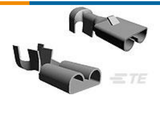
TE Part #160366-2 FF 110 SR. REC 22-20AWG TPBR