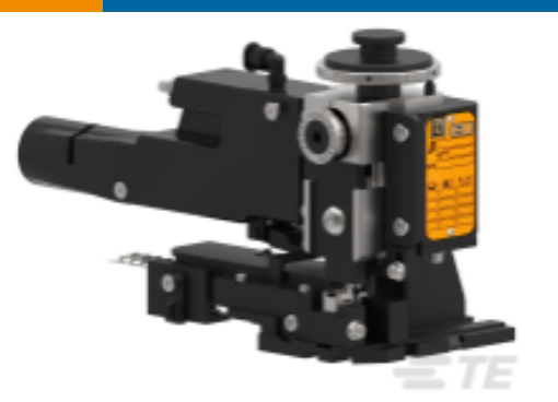
TE Part # 2151338-2 OCEAN-2.0-APPLICATOR-S-140F140O210O