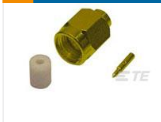
TE Part #1-1478903-0 SMA STR PLG DS RG402 GSS