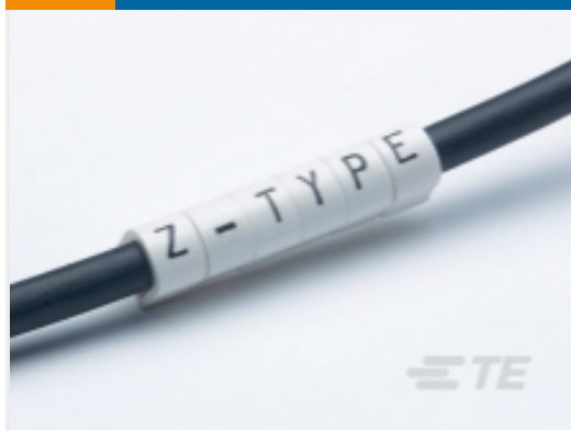
TE Part #EC0211-000 05811707