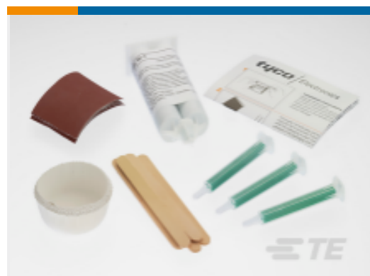
TE Part # 657863-000 S1125-KIT-8