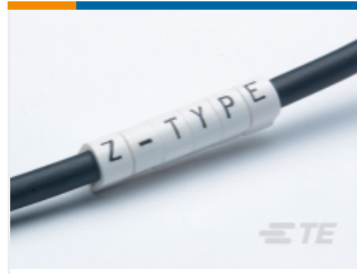
TE Part #EC0210-000 05811606