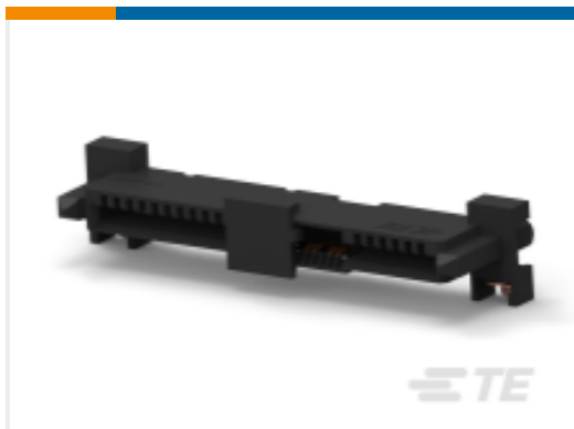
TE Part # 2170563-1 12G SAS RECEPTACLE, 29 POS