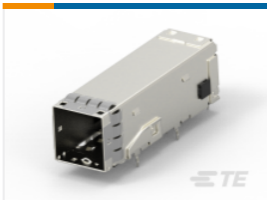
TE Part # 2149027-1 MiniSAS HD 1x1 Rec Assy