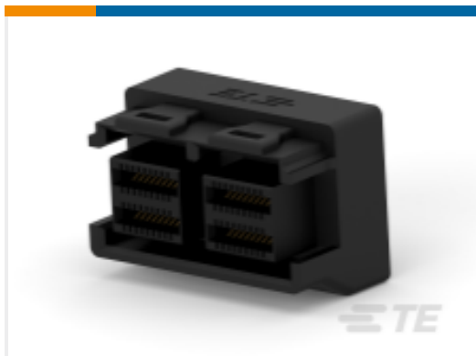
TE Part # 2227640-1 1X2 VERT ASSY, MINI SAS HD INTERNAL