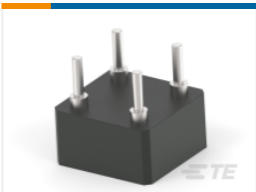
TE Part # 2185275-1 ASY, RMVL TL, SHROUD, MINI-SAS