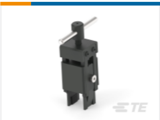
TE Part # 2215044-2 ASSY, REMOVAL TOOL