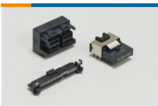
SAS & MiniSAS(10)