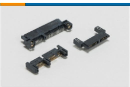
SATA & Micro SATA(1)