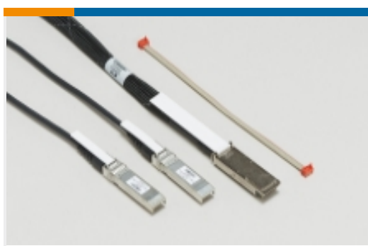
Pluggable I/O Cable Assemblies(18)