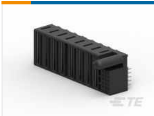
TE Part #2204426-1 MULTI-BEAM HD VERTICAL REC. 15S+4P+4P