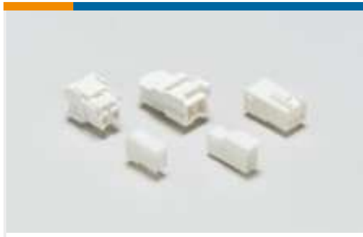
Rectangular Power Connectors(46)