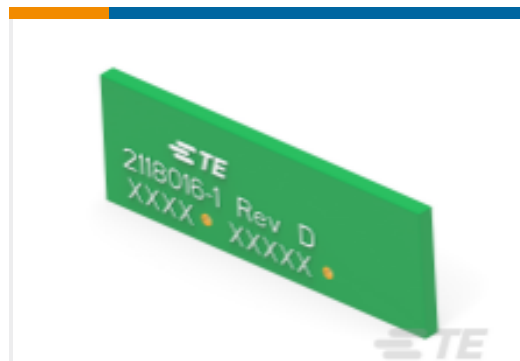
TE Part # 2118016-1 PCB ANTENNAS, WLAN DUAL BAND