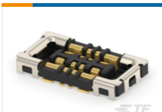
TE Part #2386586-1 FINE PITCH BTB CONN H0.8, 8P