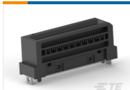
TE Part #2327679-8 RECEPTACLE ASSY, 56 POS, VERT, GEN Z