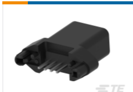
TE Part #2-1379700-2 4W TH HEADER ASSY GREY