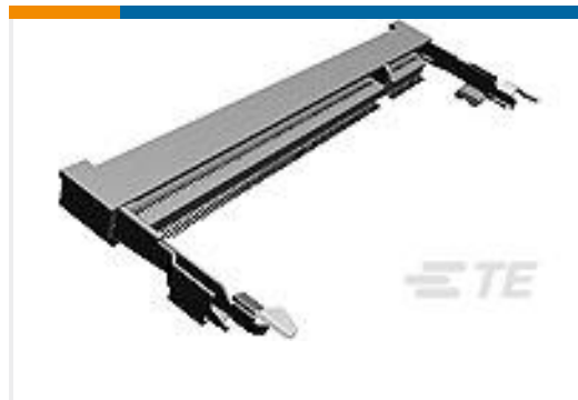
TE Part #1565918-4 EMBOSS ASSY DDR2 SODIMM SOCKET 200P 5.2H