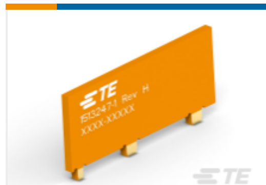
TE Part # 1513247-1 PCB US DUAL BAND ANTENNA