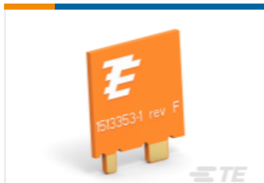
TE Part # 1513353-1 PCB ANTENNA SINGLE BAND