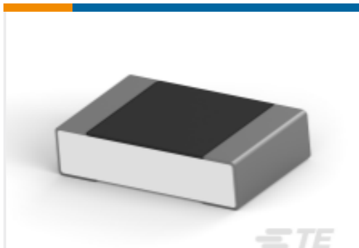
TE Part #2176382-5 RQ 0805 147K 0.1% 10PPM 5K RL