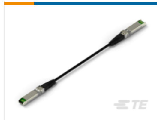
TE Part # CAT-C11-N4901114 SFP28 to SFP28 Cable Assembly: 30 AWG