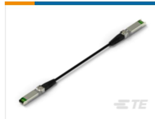
TE Part # 4-2821224-5 SFP56 DIRECT ATTACH CA, 3M, 26AWG