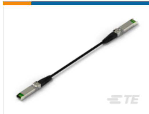
TE Part # 2334985-2 SFP28 DIRECT ATTACH CA, 1M, 32AWG