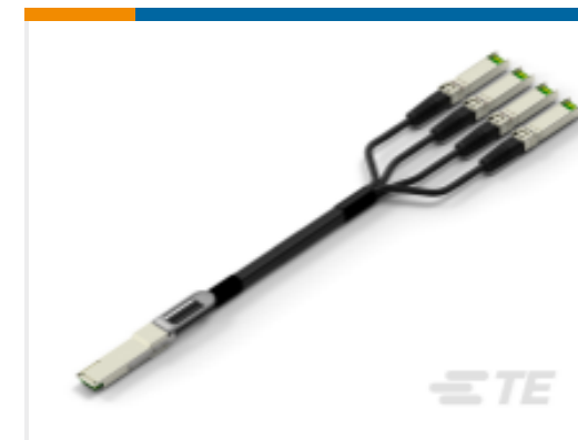
TE Part # CAT-C11-N490325 QSFP28-Four SFP+ Cable Assembly: 26 AWG