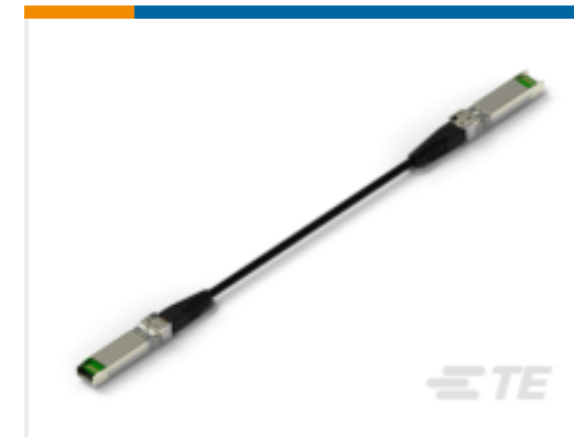
TE Part # 4-2334985-2 SFP56 DIRECT ATTACH CA, 1M, 32AWG