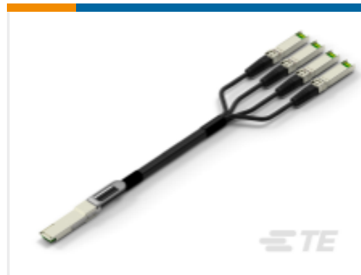
TE Part # CAT-Q17-N490333 QSFP56-Four SFP56 Cable Assembly: 26 AWG