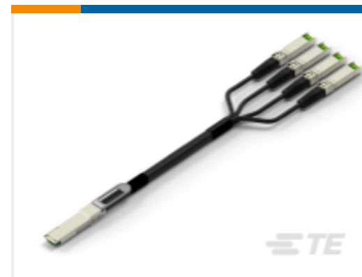
TE Part # CAT-C11-N490333 QSFP28-Four SFP+ Cable Assembly: 30 AWG