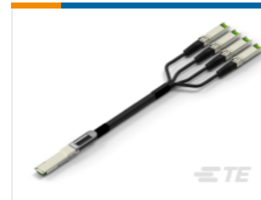
TE Part # CAT-Q17-N49011 QSFP56-Four SFP56 Cable Assembly: 30 AWG