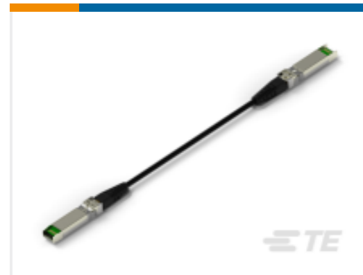
TE Part # 4-2821222-5 SFP56 DIRECT ATTACH CA, 2M, 30AWG