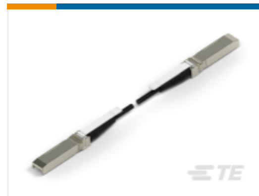
TE Part # CAT-C11-H50626 SFP+ to SFP+ I/O Cable Assembly: 30 AWG