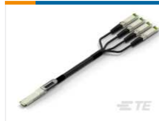
TE Part # CAT-C11-N490333 QSFP28-Four SFP+ Cable Assembly: 30 AWG