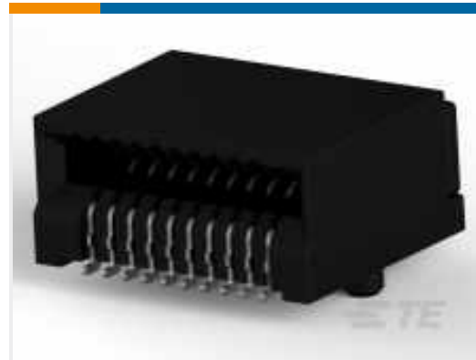
TE Part # 2110759-1 PT CONN ASSY 20 POS 16G SFP