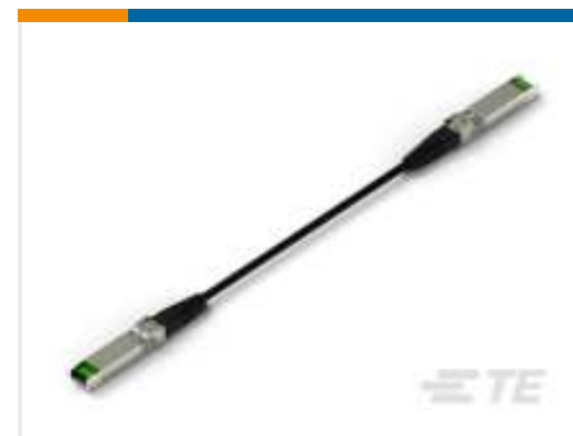
TE Part # CAT-C11-N49011 SFP28 to SFP28 Cable Assembly: 26 AWG