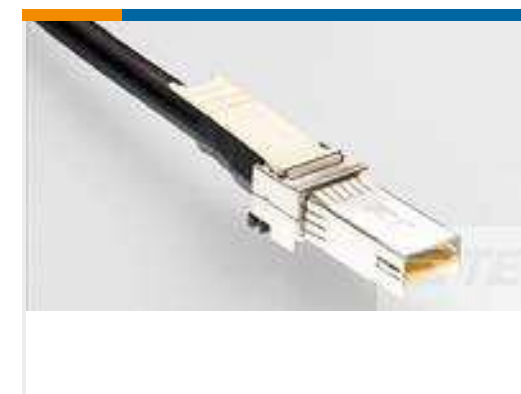
TE Part # 2142970-1 CABLE ASSY, MICRO SFP+ TO STD SFP+, 0.5M