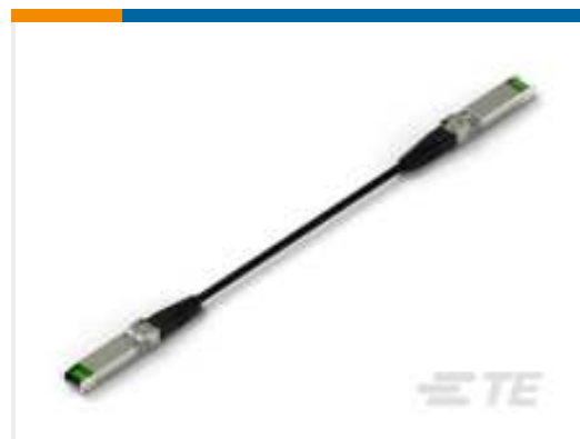
TE Part # 2334985-2 SFP28 DIRECT ATTACH CA, 1M, 32AWG