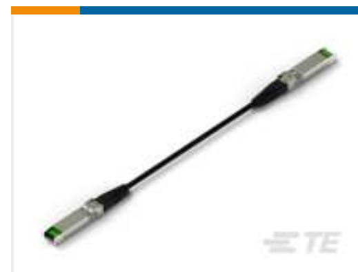
TE Part # 4-2821224-5 SFP56 DIRECT ATTACH CA, 3M, 26AWG