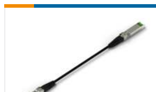
TE Part # 4-2334985-2 SFP56 DIRECT ATTACH CA, 1M, 32AWG