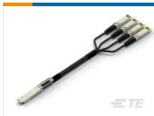
TE Part # CAT-Q17-N490333 QSFP56-Four SFP56 Cable Assembly: 26 AWG