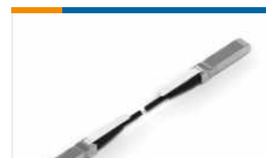
TE Part # CAT-C11-H5 SFP+ to SFP+ I/O Cable Assembly: 24 AWG