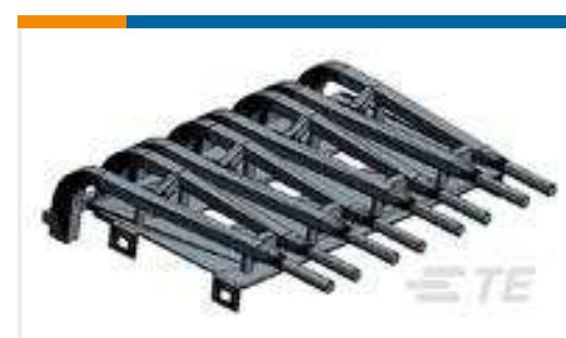
TE Part # 2170068-1 SFP+ 1x4 Light Pipe Assembly Low Profile