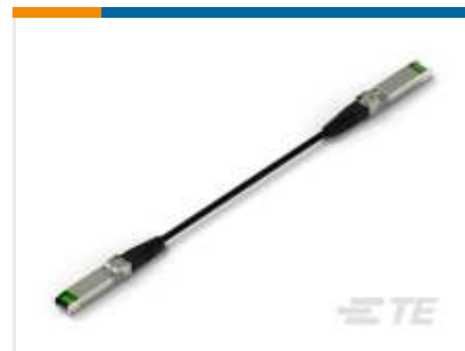
TE Part # CAT-C11-N4901114 SFP28 to SFP28 Cable Assembly: 30 AWG