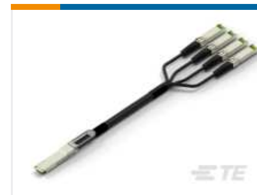
TE Part # CAT-Q17-N49011 QSFP56-Four SFP56 Cable Assembly: 30 AWG