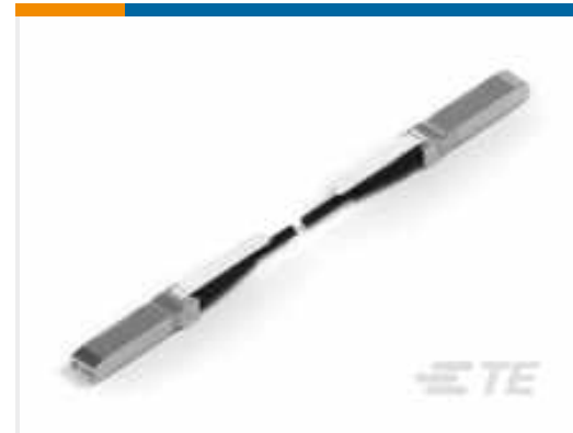
TE Part # CAT-C11-H50626 SFP+ to SFP+ I/O Cable Assembly: 30 AWG