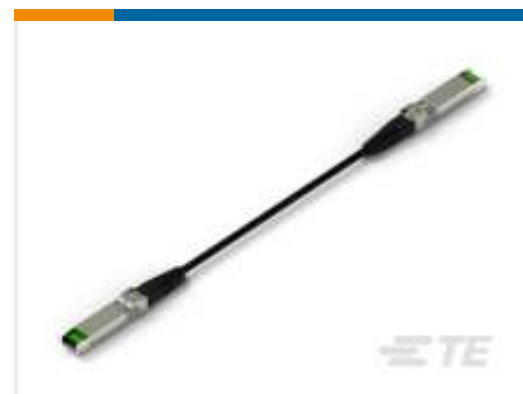
TE Part # 4-2821222-5 SFP56 DIRECT ATTACH CA, 2M, 30AWG