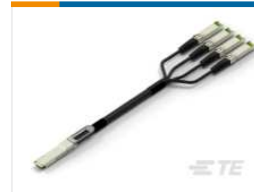
TE Part # CAT-C11-N490325 QSFP28-Four SFP+ Cable Assembly: 26 AWG