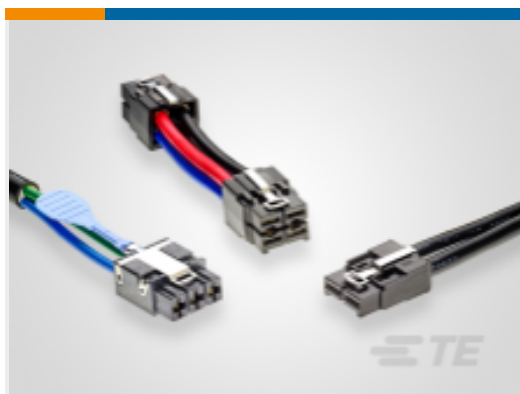
TE Part #2304890-1 CA, ET, 4POS, NO PULL-TAB, NO DETECT, SHIEL