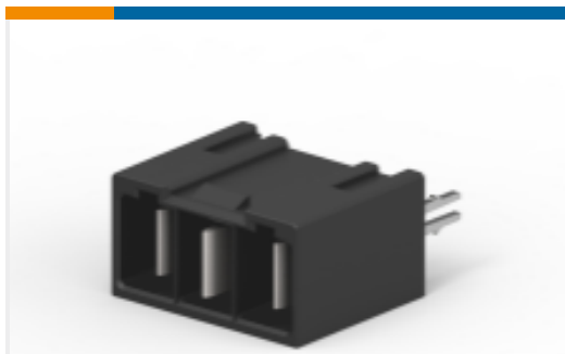
TE Part #2204585-2 ELCON MINI 3P VERT HEADER, SOLDER, T/P