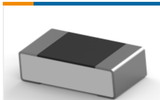
TE Part #7-2176367-7 RQ 0603 28K7 0.1% 10PPM 1K RL