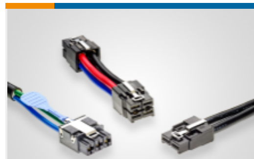
TE Part #2304889-1 CA, ET, 4POS, NO PULL-TAB, NO DETECT, NO S