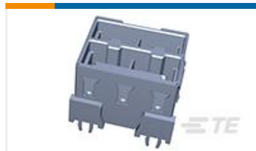
TE Part #2173211-1 ELCON MINI 4P VERT HEADER, SHIELDED, SOL