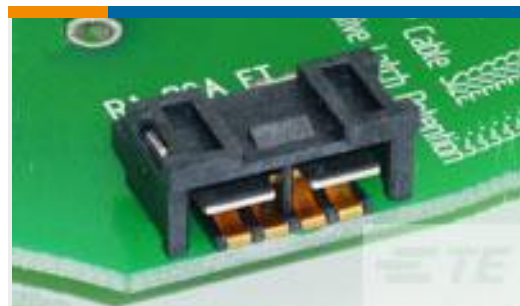
TE Part #1982295-2 ELCON MINI 2P RA HEADER, W/O CODING