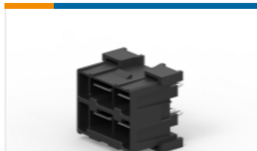
TE Part #2173132-2 ELCON MINI 4P VERT HEADER, UNSHIELDED, P/F