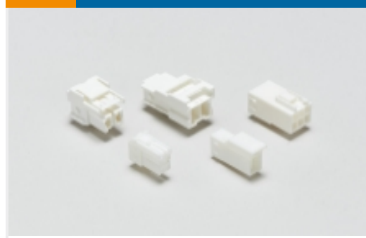
Rectangular Power Connectors(32)