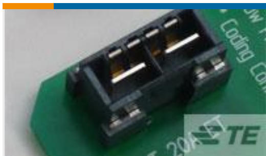
TE Part #2042274-2 ELCON MINI 2P VERT HEADER, W/O CODING