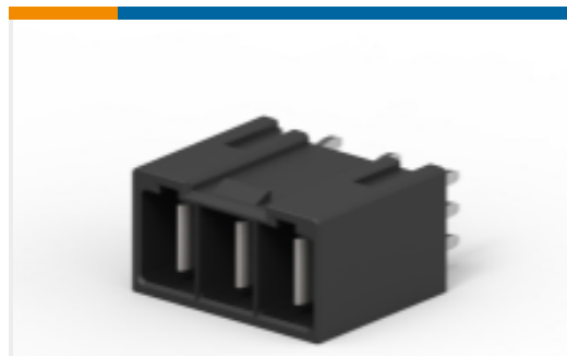
TE Part #2204585-3 ELCON MINI 3P VERT HEADER, PRESS-FIT, STD