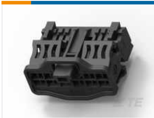
TE Part # 2177588-1 20POS NANO MQS TL PLUG HOUSING, CODE A