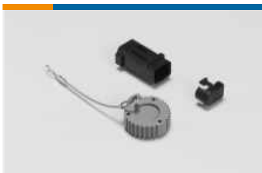
Automotive Connector Caps & Covers (133)