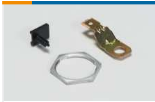
Other Automotive Connector Accessories(13)