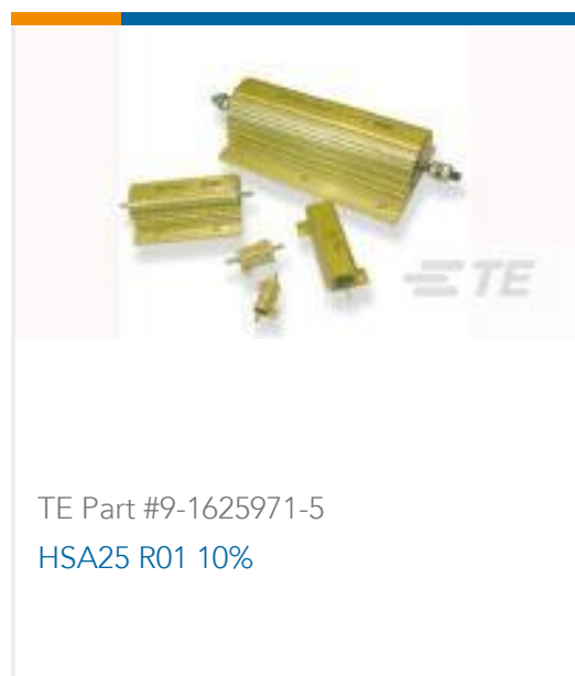
TE Part #9-1625971-5 HSA25 R01 10%