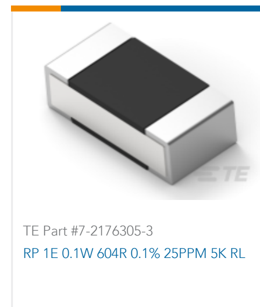
TE Part #7-2176305-3 RP 1E 0.1W 604R 0.1% 25PPM 5K RL