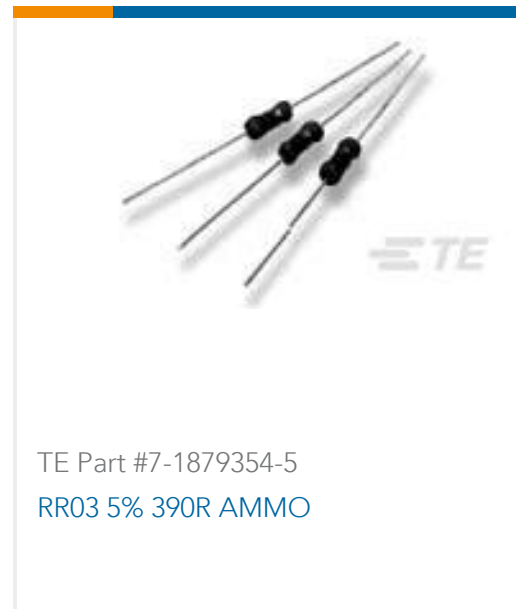
TE Part #7-1879354-5 RR03 5% 390R AMMO