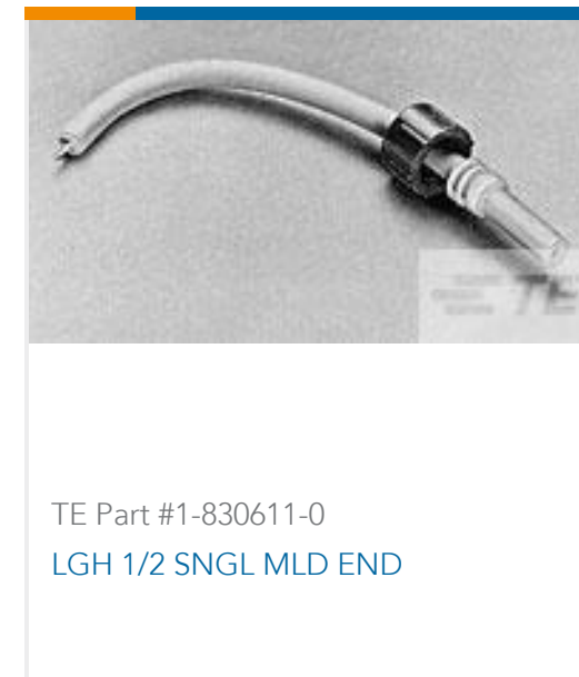
TE Part #1-830611-0 LGH 1/2 SNGL MLD END