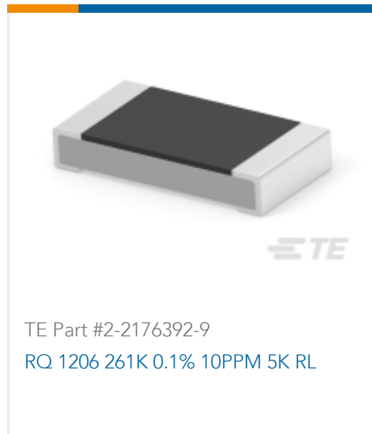
TE Part #2-2176392-9 RQ 1206 261K 0.1% 10PPM 5K RL