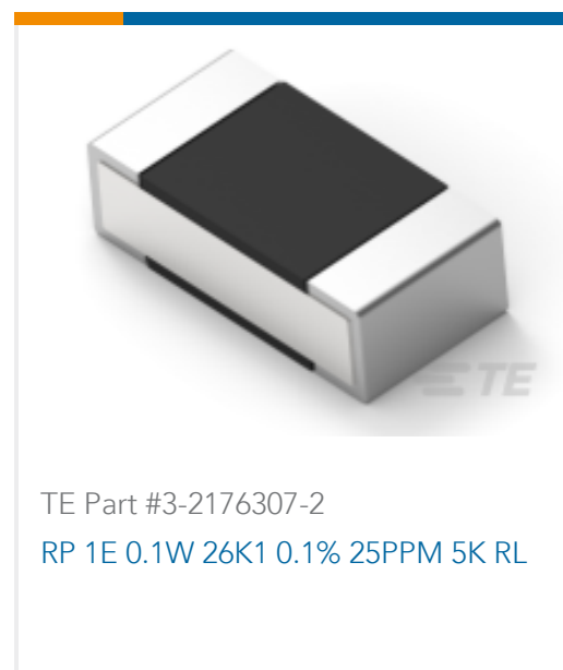
TE Part #3-2176307-2 RP 1E 0.1W 26K1 0.1% 25PPM 5K RL