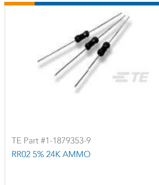
TE Part #1-1879353-9 RR02 5% 24K AMMO