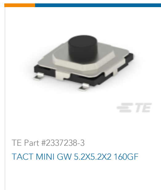
TE Part #2337238-3 TACT MINI GW 5.2X5.2X2 160GF