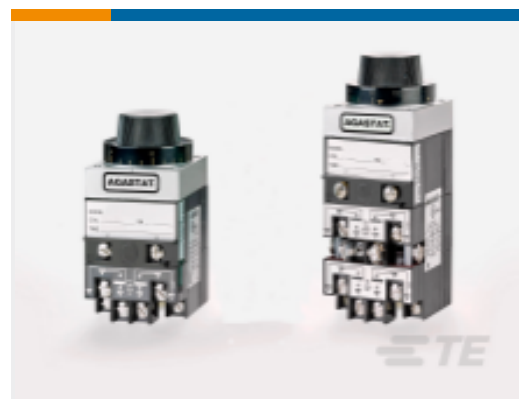
TE Part #1423158-1 7012L10BN=RLY,NAV,ON,2P,440VA