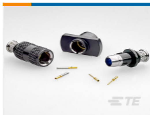
TE Part #2226910-1 NETT WARRIOR PLUG ASSEMBLY