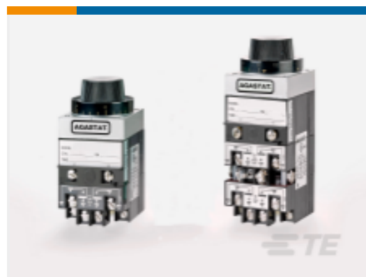
TE Part #1423163-3 7022L10HN=RLY,NAV,OFF,2P,440V