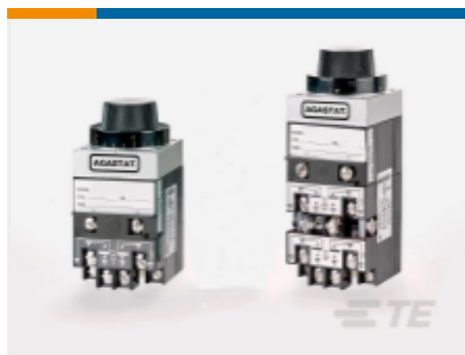
TE Part #2-1423158-3 7012L8BXN=RLY,NAV,ON,2P,115VAC