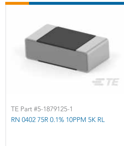
TE Part #5-1879125-1 RN 0402 75R 0.1% 10PPM 5K RL