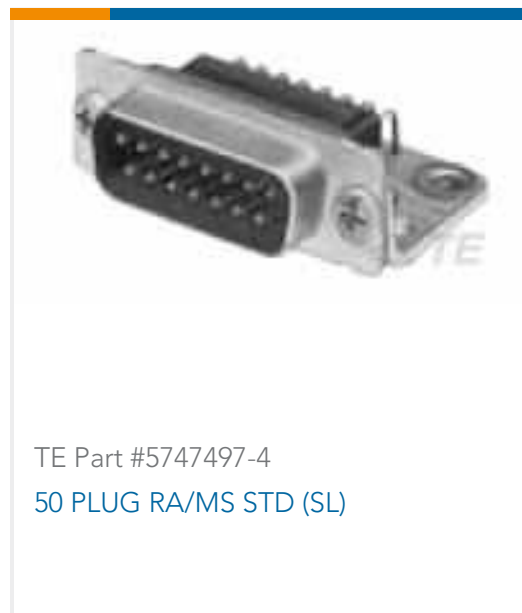
TE Part #5747497-4 50 PLUG RA/MS STD (SL)