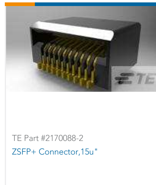
TE Part #2170088-2 ZSFP+ Connector,15u"