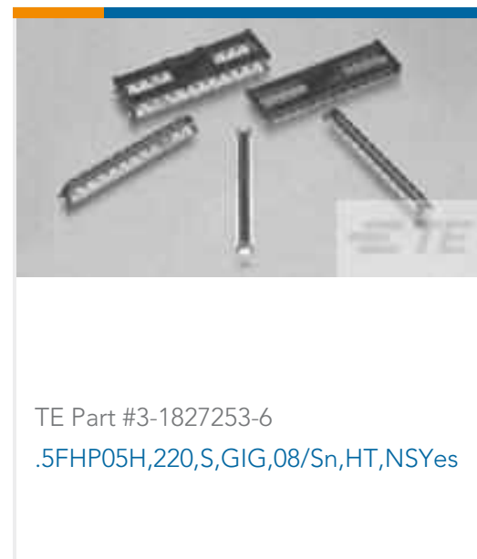
TE Part #3-1827253-6 .5FHP05H,220,S,GIG,08/Sn,HT,NSYes