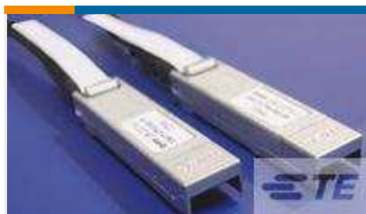
TE Part # 1948134-1 C/A, PASSIVE SFP 4.25GBPS, 0.5M, 28AWG