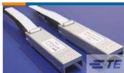
TE Part # 1948134-4 C/A, PASSIVE SFP 4.25GBPS, 3.0M, 28AWG