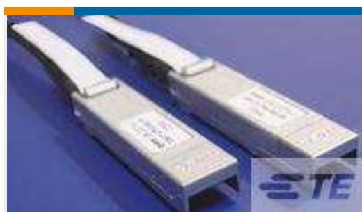
TE Part # 1948134-5 C/A, PASSIVE SFP 4.25GBPS, 4.0M, 28AWG