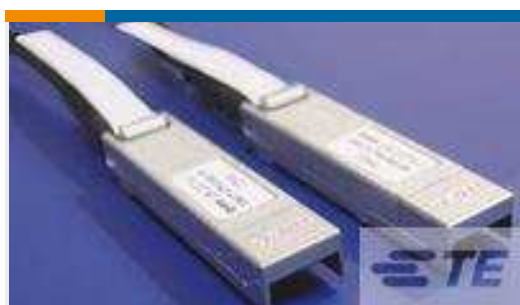
TE Part # 1948134-3 C/A, PASSIVE SFP 4.25GBPS, 2.0M, 28AWG