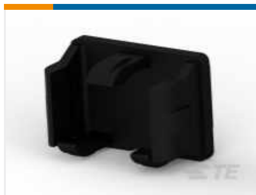
TE Part # 1367147-3 SFP COVER, UNPL, NO LOGO