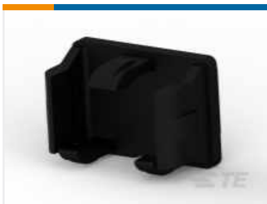
TE Part # 1367147-1 SFP COVER, UNPLATED