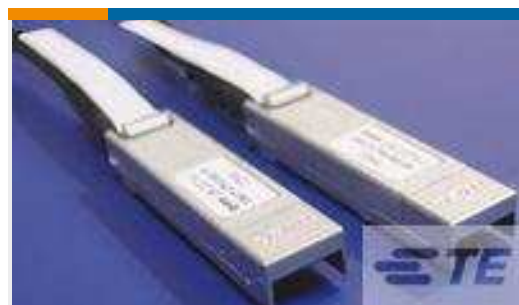
TE Part # 1948134-2 C/A, PASSIVE SFP 4.25GBPS, 1.0M, 28AWG