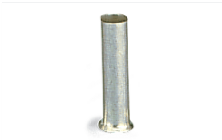
Color: ■ silver-colored