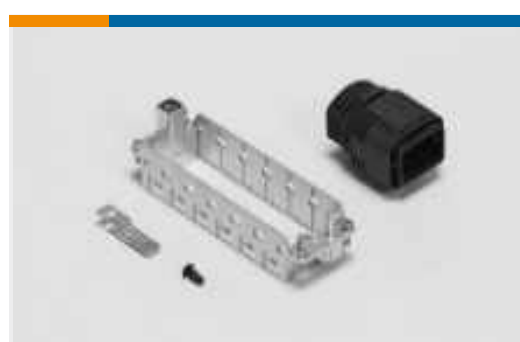
Rectangular Connector Hardware(52)