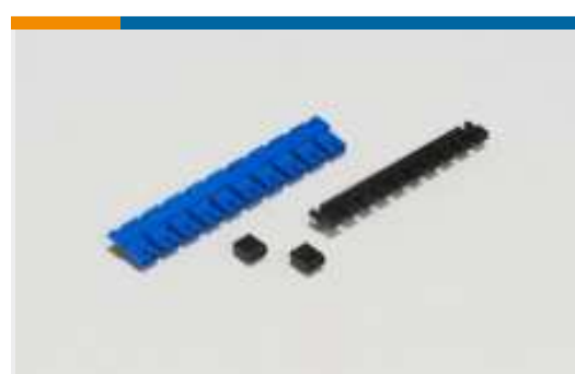
Board-to-Board Jumpers &amp; Shunts(7)