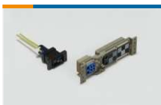
Rack &amp; Panel Connectors(1)