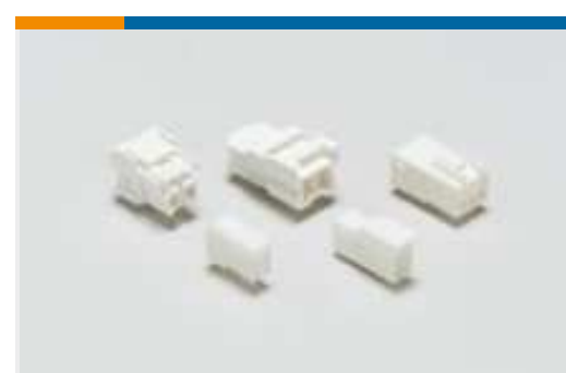
Rectangular Power Connectors(66)