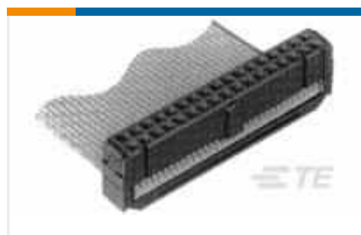
TE Part #1658622-6 26 NOVO MIL/CTR 30DP, LEAD FREE