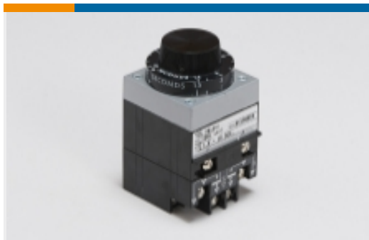
Time Delay Relays(21)