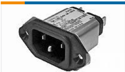
TE Part #6609987-9 15SRB1=F8219H