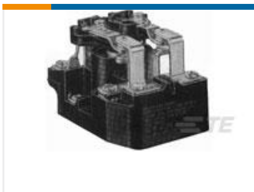
TE Part #2-1393127-0 PRD-11AJ0-120=PRD