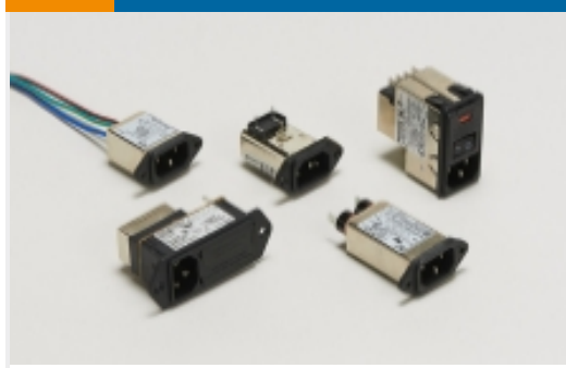
Multi-Function Inlet Filters(45)