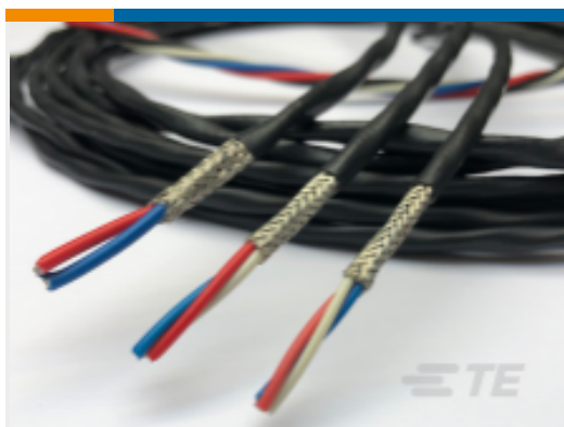
TE Part #2336364-2 RL1141-0.75-9/9/9-0