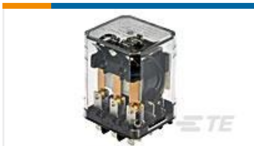
TE Part #5-1393117-5 KUP-11D55-110=KU