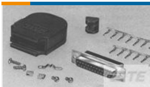
TE Part #749812-7 KIT,HDP-20,RCPT, SIZE 1, 9 POS