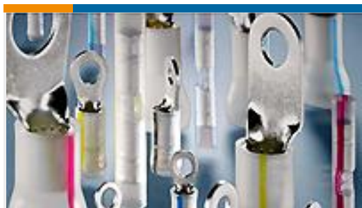
TE Part #53417-1 TERMINAL,PIDG PVF2 R 16-14 8