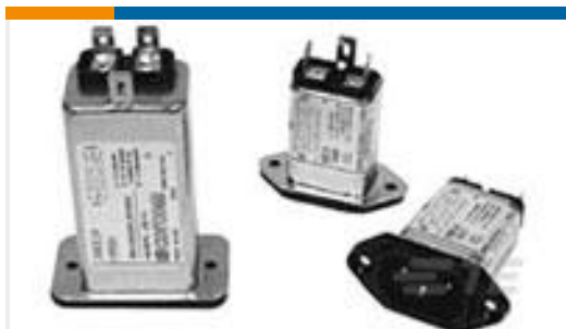
TE Part #6609007-6 20EEJ8=F8125