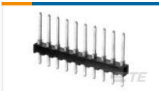
TE Part #1-87221-0 11 MODII HDR SRST UNSHRD .150