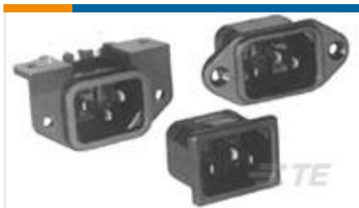
TE Part #1609133-1 6ESRF-3=F6988