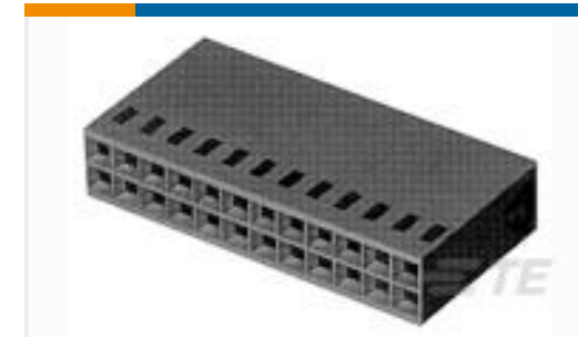
TE Part #87456-6 10 MODIV HSG DR MRKD .100CL