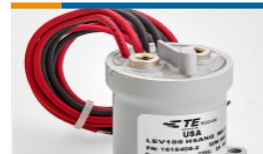
TE Part #1618408-2 LEV100H5CNG = CONTACTOR WITH AUX SPST