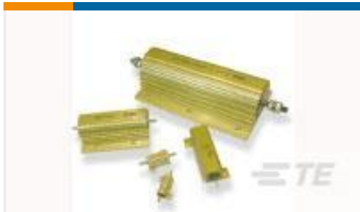
TE Part #1625999-1 HSC100 100R 5%