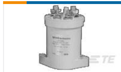
TE Part #5-1618388-5 LEV200H5ANA=RELAY, SPST-NO