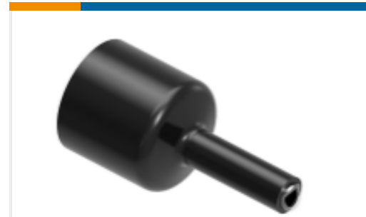
TE Part #NB07744001 HTAT-24/6-0-SP