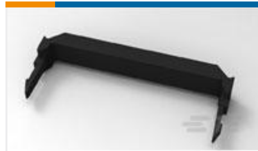
TE Part #499252-3 026 STRAIN RELIEF A-L RCPT