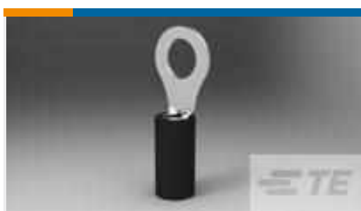
TE Part #50845-2 TERMINAL,PIDG PTFE R 12-10 10