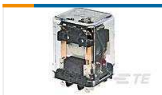
TE Part #4-2027183-3 KUEP-11D15-125=RELAY,3A,2C, AGCDO,QC.187,