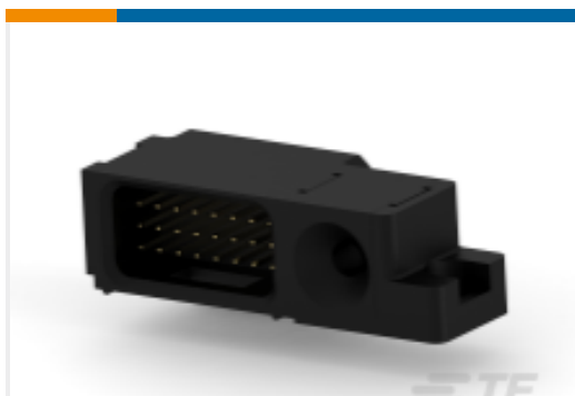
TE Part #2085119-1 24PIN RECTANGULAR POWER CONNECTORS