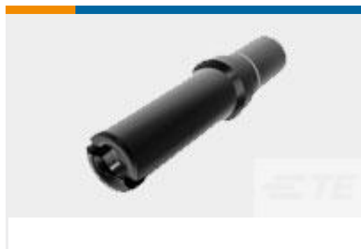
TE Part #1648384-1 708-73-01109=SA CONTACT,SKT