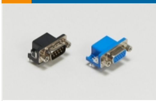
PCB D-Sub Connectors(353)