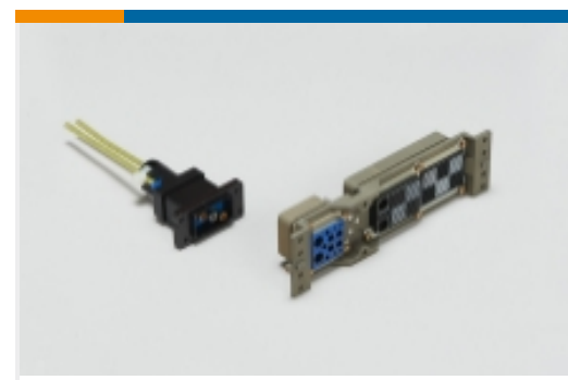
Rack & Panel Connectors(1)