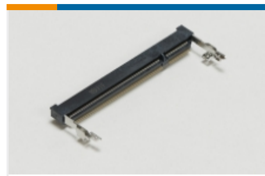
SO DIMM Sockets(12)