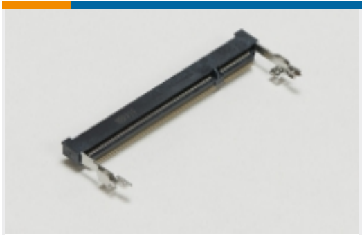
SO DIMM Sockets(12)