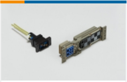
Rack & Panel Connectors(1)