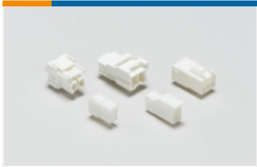
Rectangular Power Connectors(9)